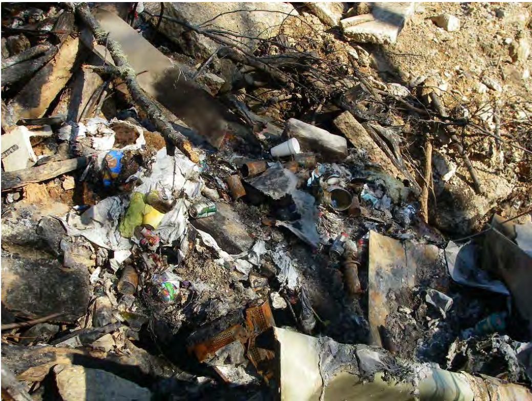
Complaint 009401 Followup Insp.12-10-09