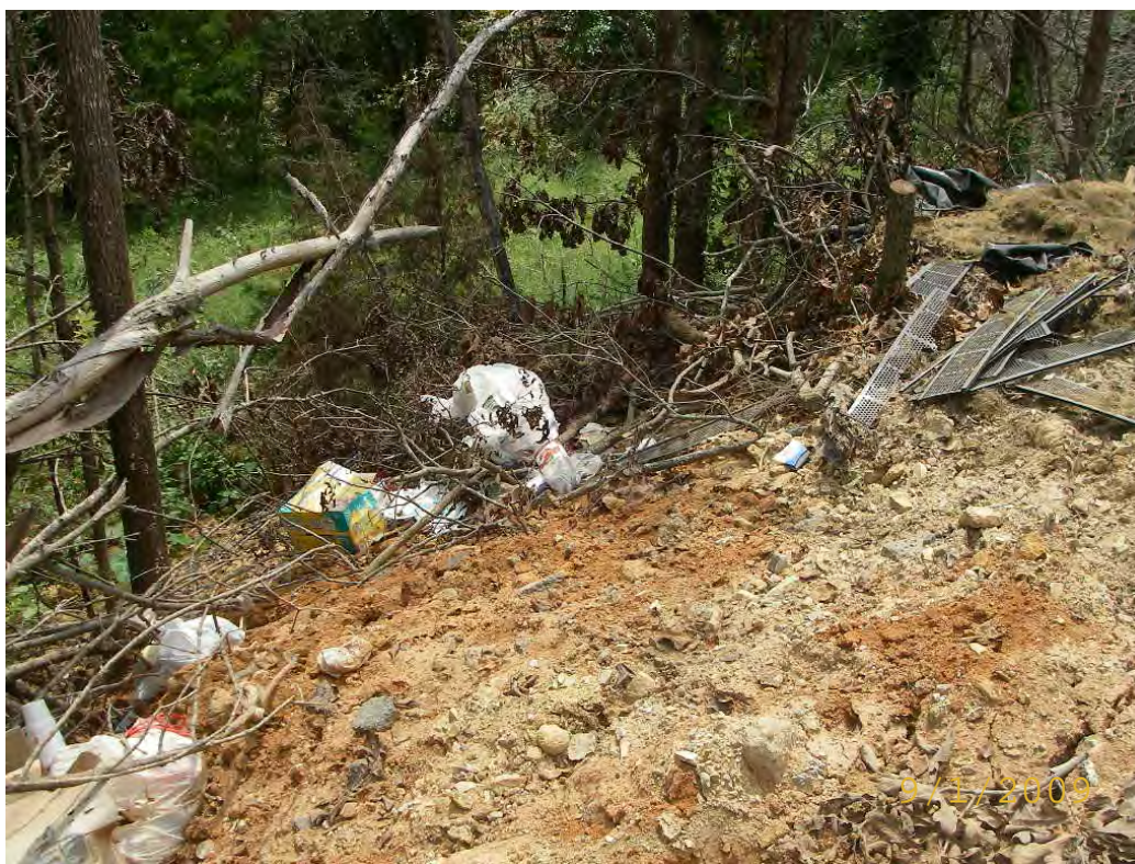
Baxter CR274 Roadside Dump