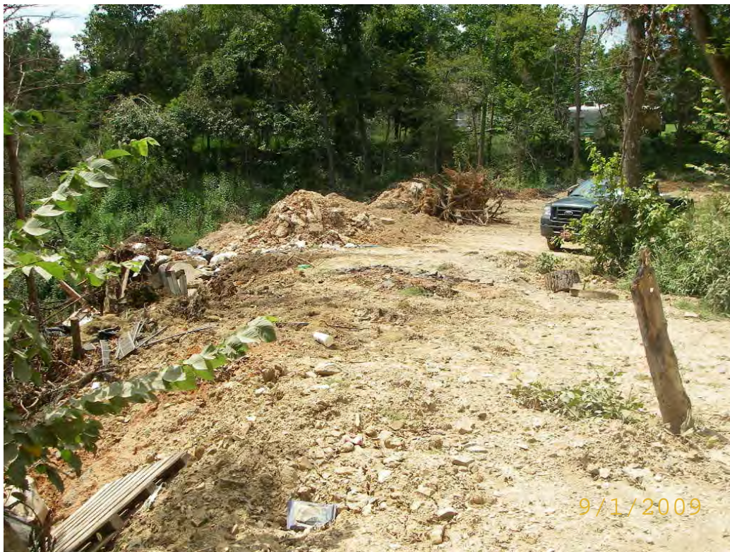
Baxter CR274 Roadside Dump