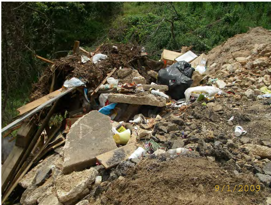
Baxter CR274 Roadside Dump