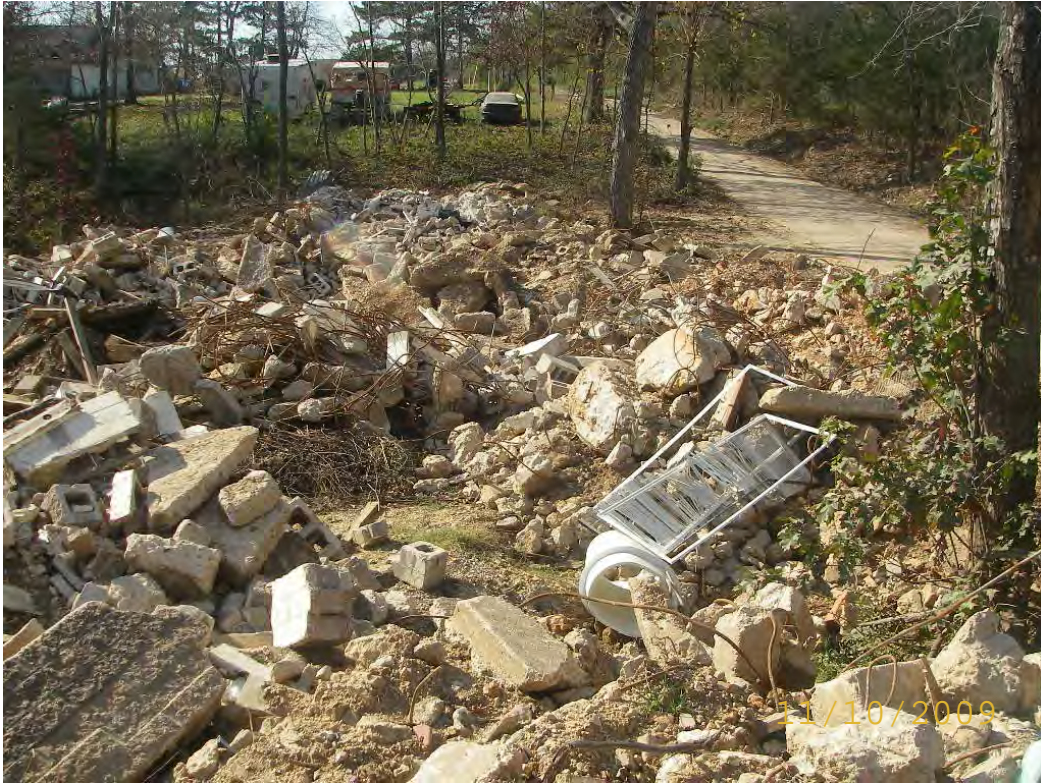
Complaint # 009401.Followup Insp.