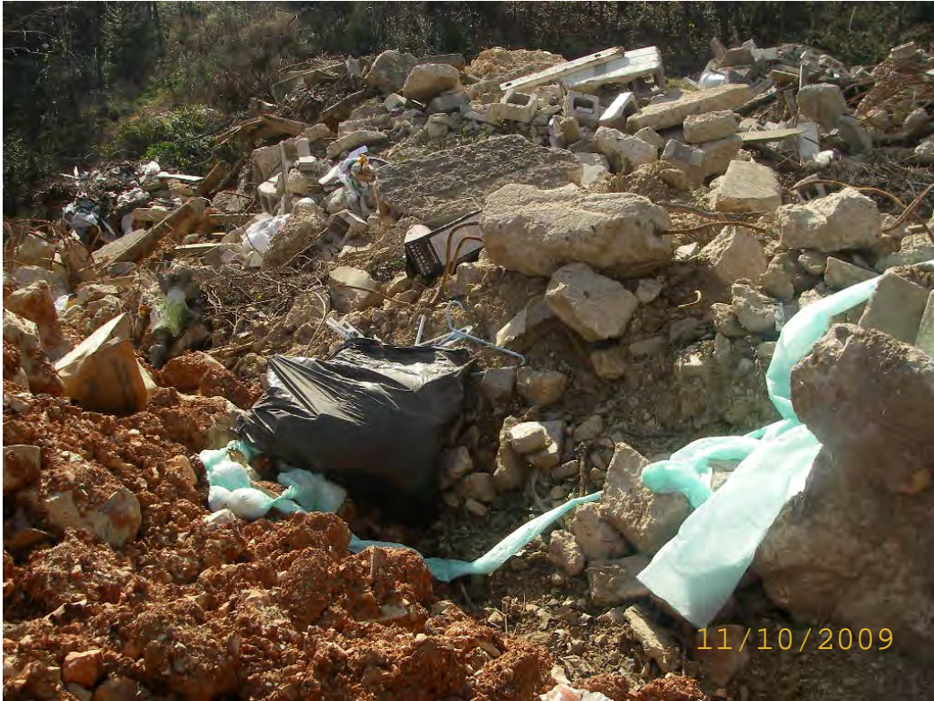
Complaint # 009401.Followup Insp.