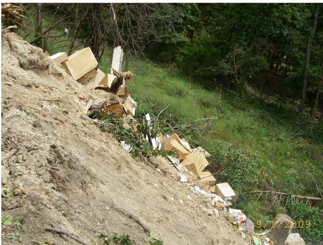
Baxter CR274 Roadside Dump