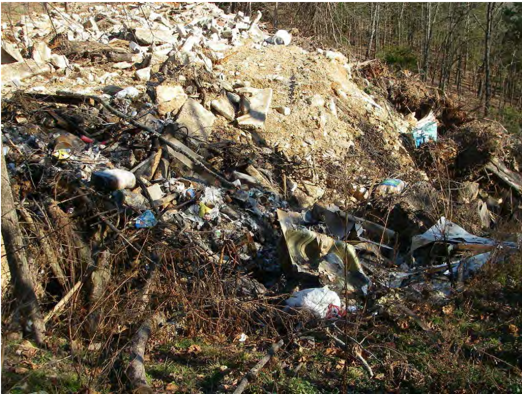
Complaint 009401 Followup Insp.12-10-09