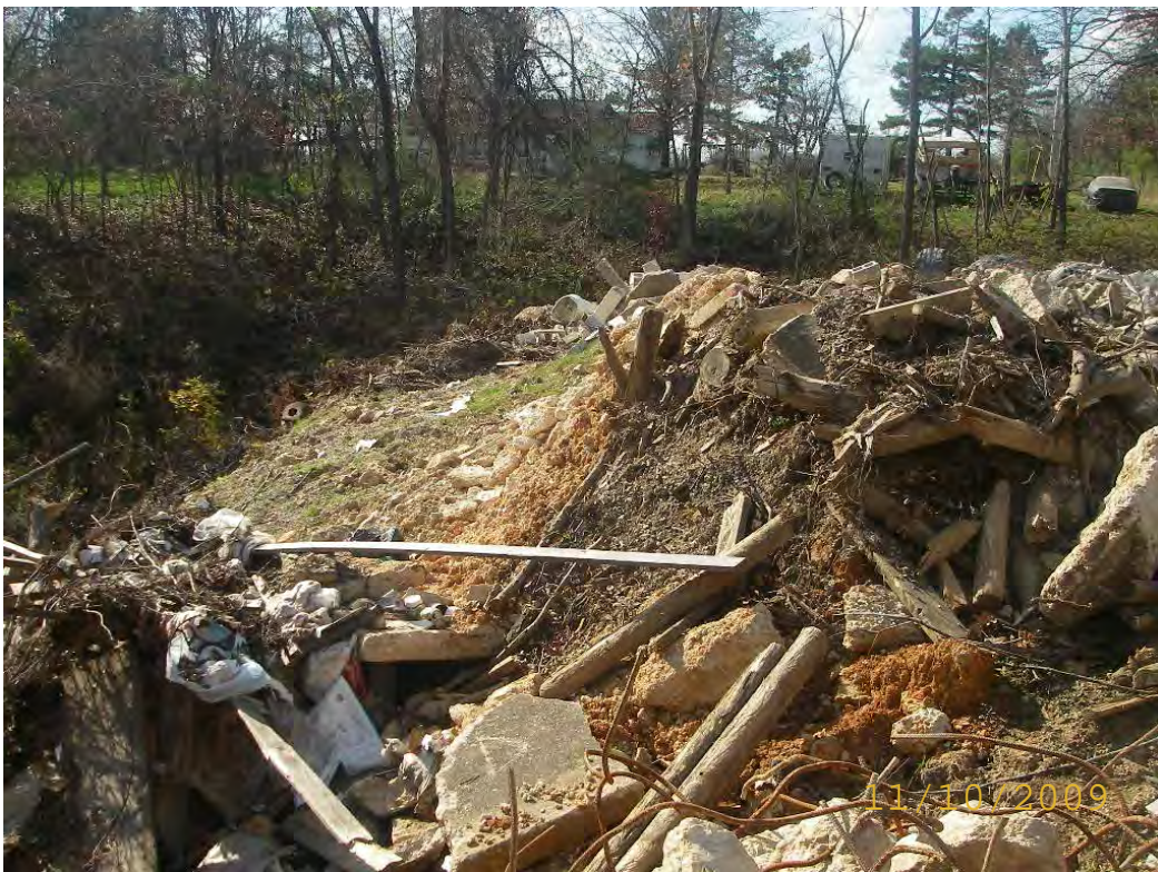
Complaint # 009401.Followup Insp.