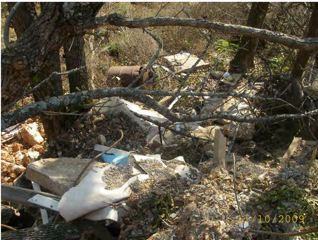
Complaint # 009401.Followup Insp.