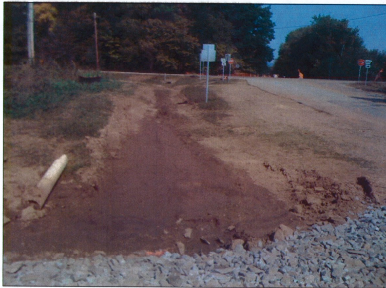
Photo 3: Looking North from Construction Entrance at drainage ditch along west side of Hwy 282