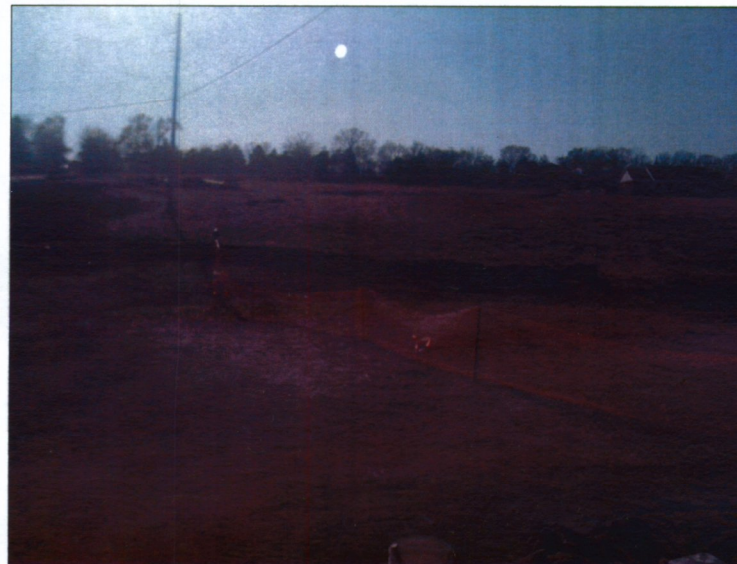
Photo 6: Looking South from North side of Hurricane Creek at restored ground surface