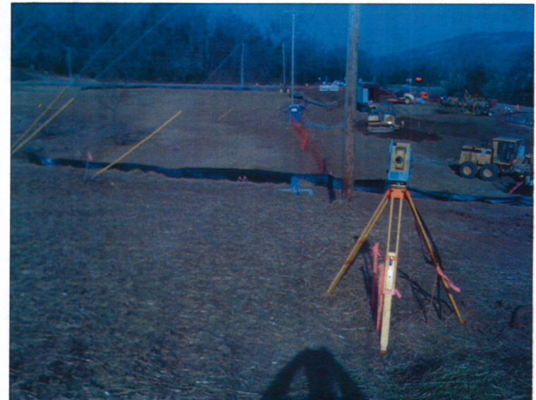
Photo 5: Looking North from South side of Hurricane Creek along alignment of waterline