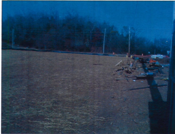
Photo 4: Looking North from North side of Hurricane Creek along alignment of waterline