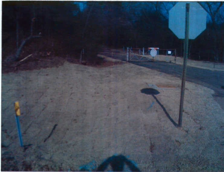
Photo 1: Looking North from Dollard Road along West side of Drive (Old Hwy 282)