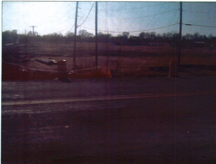
Photo 3: Looking South from Dollard Road at restored ground surface