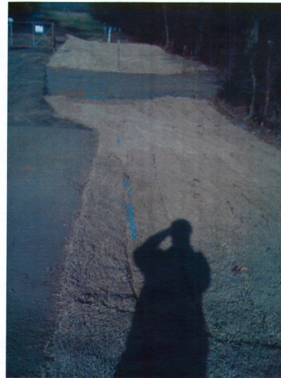
Photo 2: Looking North from Dollard Road along East side of Drive (Old Hwy 282)