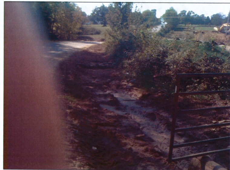
Photo 4: Looking South from Construction Entrance at drainage ditch along west side of Hwy 282