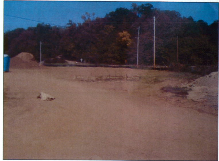
Photo 2: Looking Northeast from Construction Entrance at straw bale check dam and restored ground surface above previous bore pit