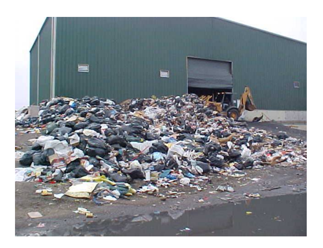
Site Photo: Osceola Incinerator Site – June 2007

Site Photo: Osceola Incinerator Site – March 2003