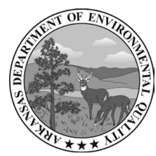
ADEQ 5301 Northshore Drive North Little Rock, Arkansas 72118