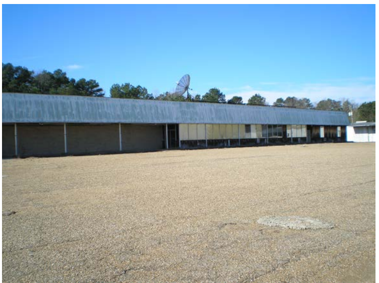
Photo: Front of Building of Former Value Line Company on Tenth Street.