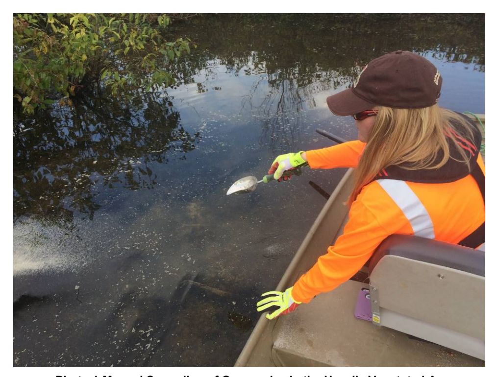
Photo 1 Manual Spreading of Organoclay in the Heavily Vegetated Area