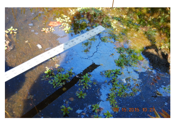
Silver Gray Sheen Cover Observation on 09/15/2015