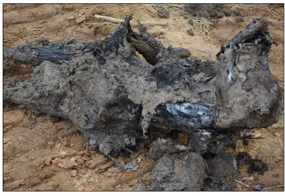
DESCRIPTION: Sheen at the excavated surface of the Inlet Channel