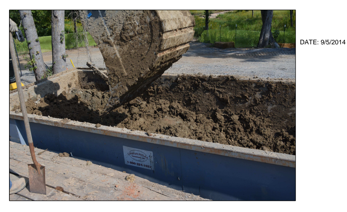
DESCRIPTION: Interstate Drive staging area prepared for sediment solidification activities

COMMENTS: Sediment solidification in the mixing unit