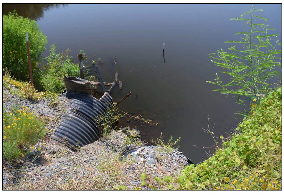
DESCRIPTION: Culvert outlet under I-40