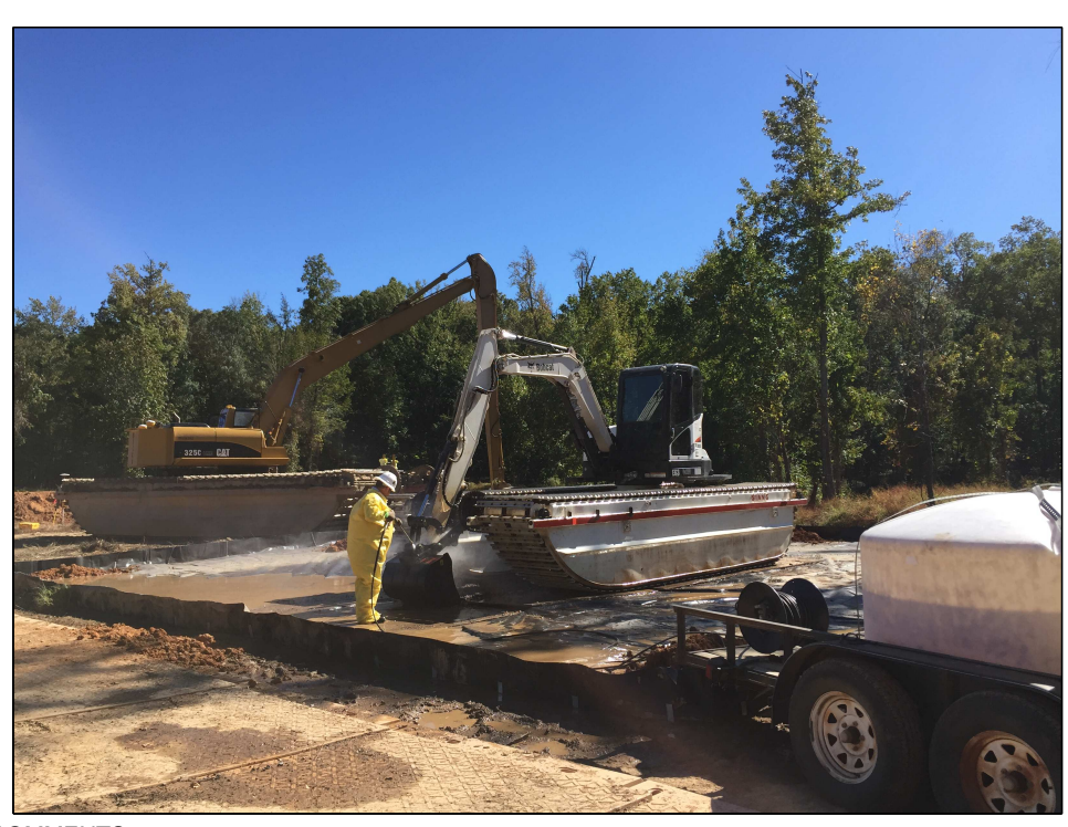
DESCRIPTION: Interstate Drive staging area prepared for mixing organoclay and sand for the reactive cap placement