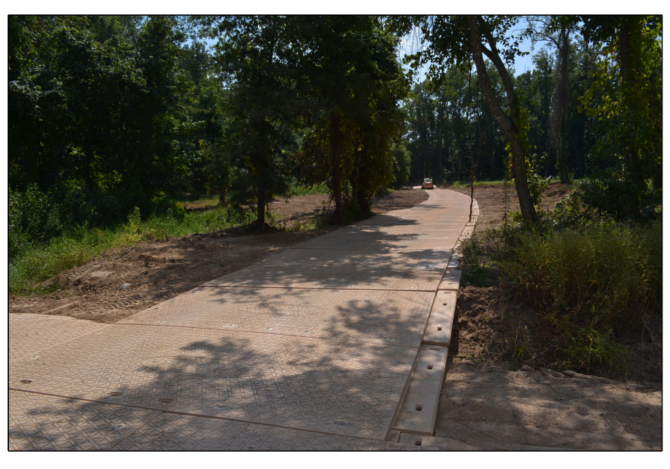
DESCRIPTION: Cleared area on the north side of the Inlet Channel