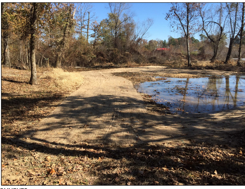
DESCRIPTION: Cove downstream of the construction area following completion of construction activities

COMMENTS: Placement of temporary erosion controls in the Open Water Area