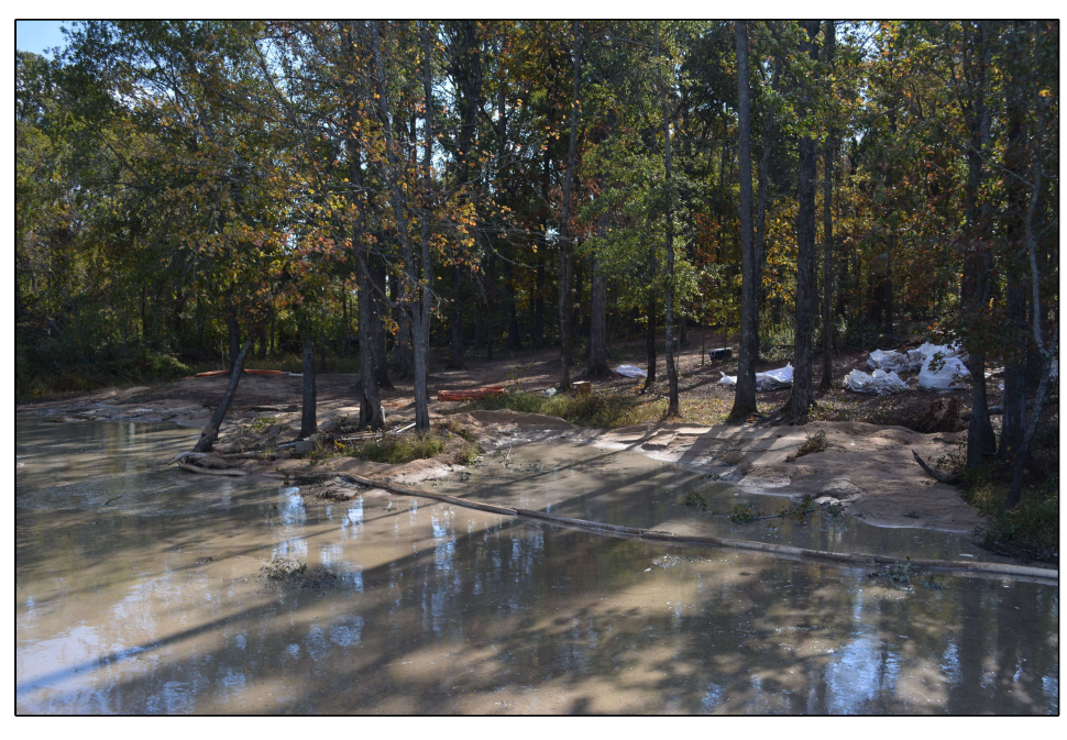
DESCRIPTION: Temporary staging area for loading of reactive cap material onto the deck buggies