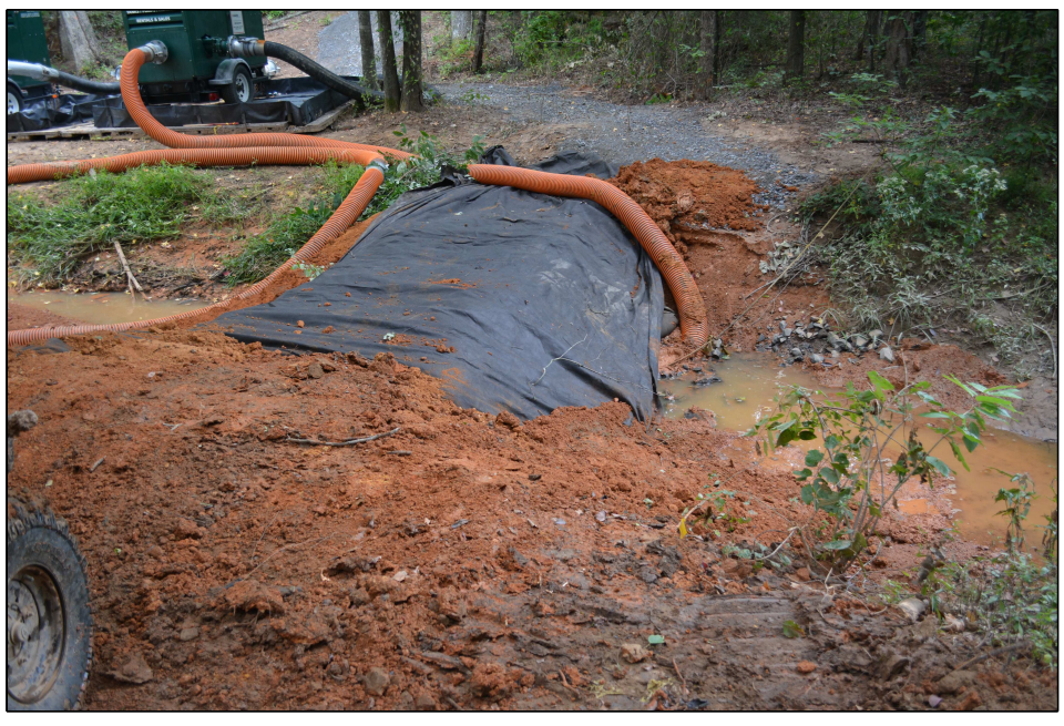
DESCRIPTION: Water flowing over the temporary dam at the upstream end of the Inlet Channel, following a heavy rain event