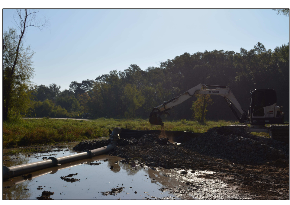
DESCRIPTION: Installation of high-density polyethylene pipes for the bypass pumping system