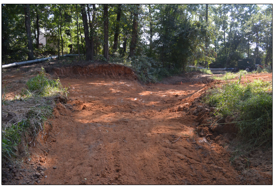
DESCRIPTION: Backfilling and grading activities at the Inlet Channel