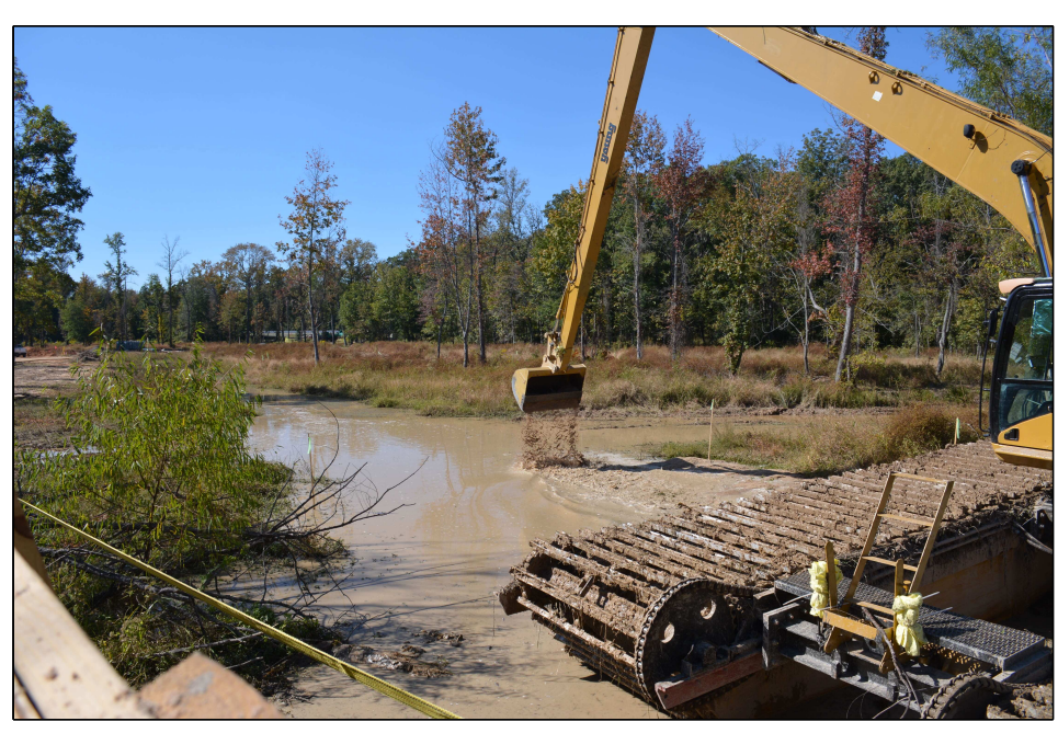
DESCRIPTION: Manual distribution of PMFI® organoclay in the Heavily Vegetated Area