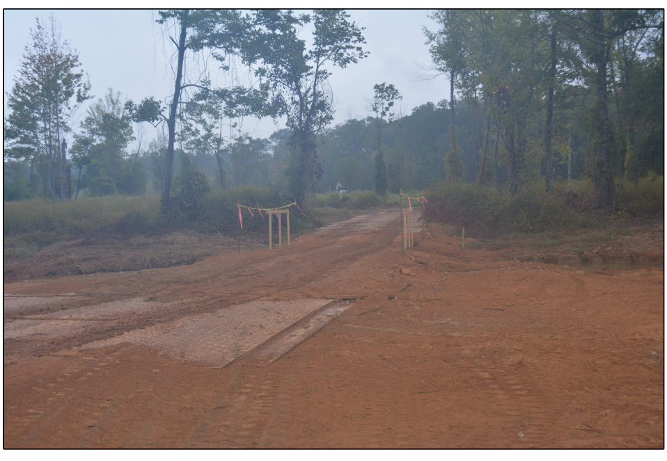
DESCRIPTION: Removal of tree stumps from the Open Water Area