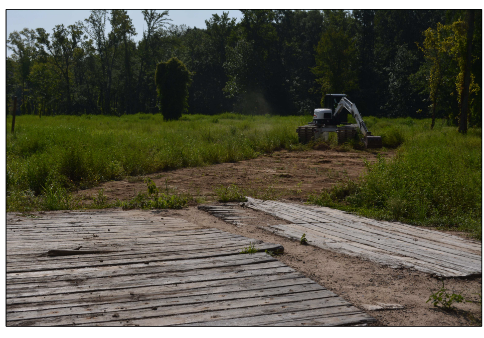
DESCRIPTION: Maintenance activities at the Interstate Drive staging area