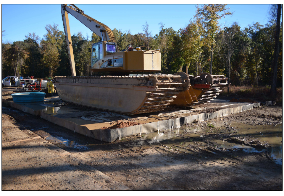
DESCRIPTION: Restored area on the west side of decontamination area