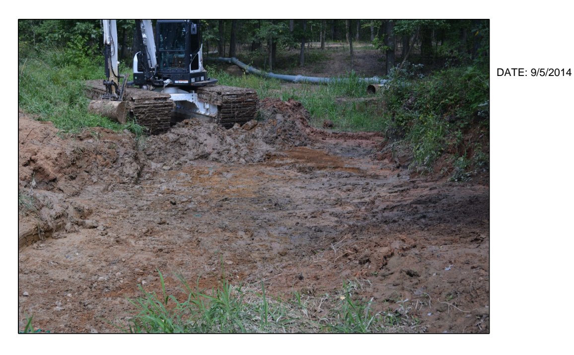
DESCRIPTION: Installation of temporary dam at the upstream end of the Inlet Channel

COMMENTS: Excavation activities at the Inlet Channel