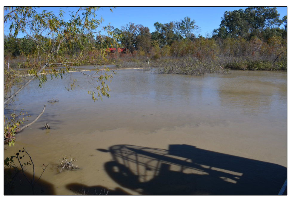
DESCRIPTION: Open Water Area following completion of construction activities