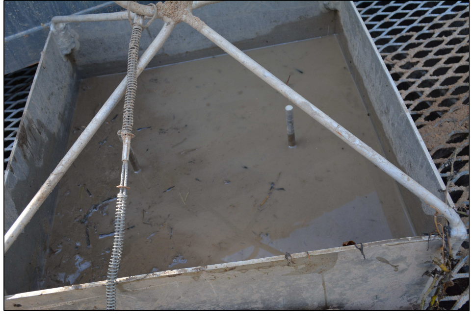
DESCRIPTION: Placement of test pan in the Open Water Area