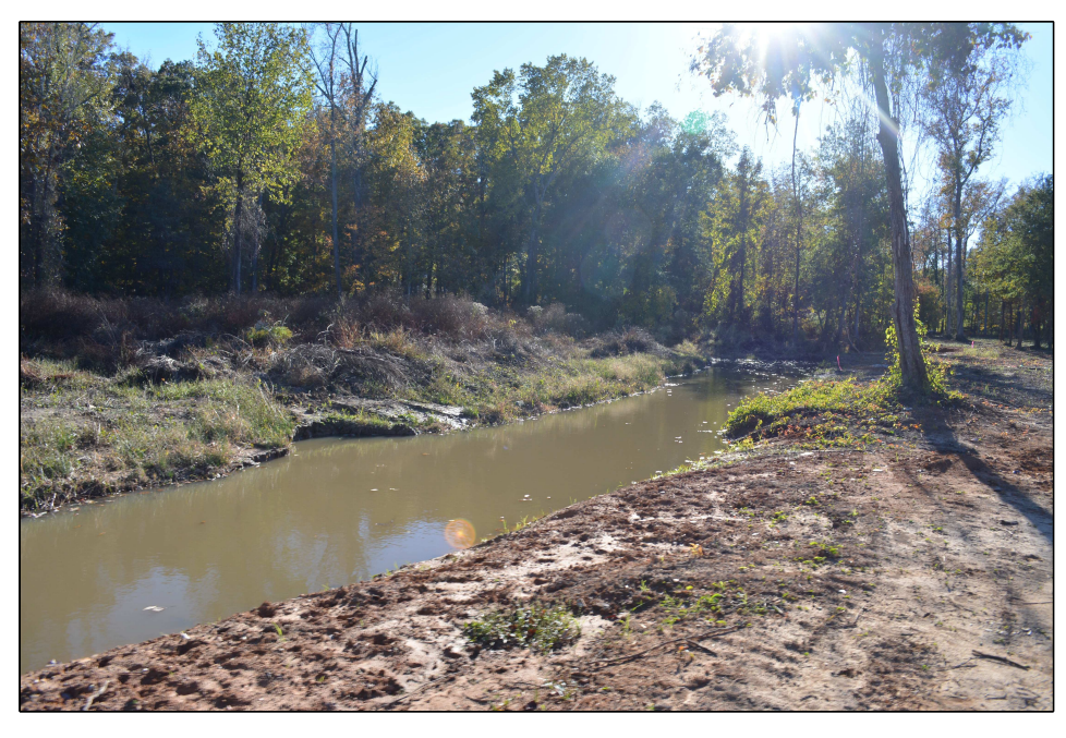
DESCRIPTION: Demobilization activities at the Interstate Drive staging area