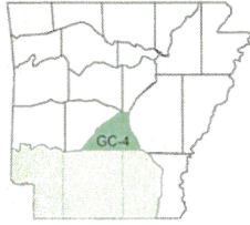
Plate GC-4 (Gulf Coastal Plain)