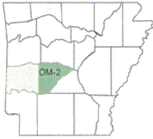
Plate OM-2 (Ouachita Mountains)