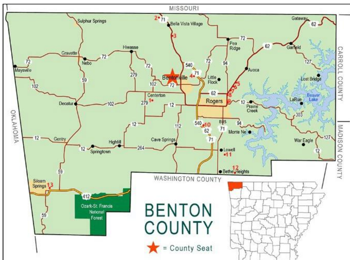
Facilities Identified on Map: