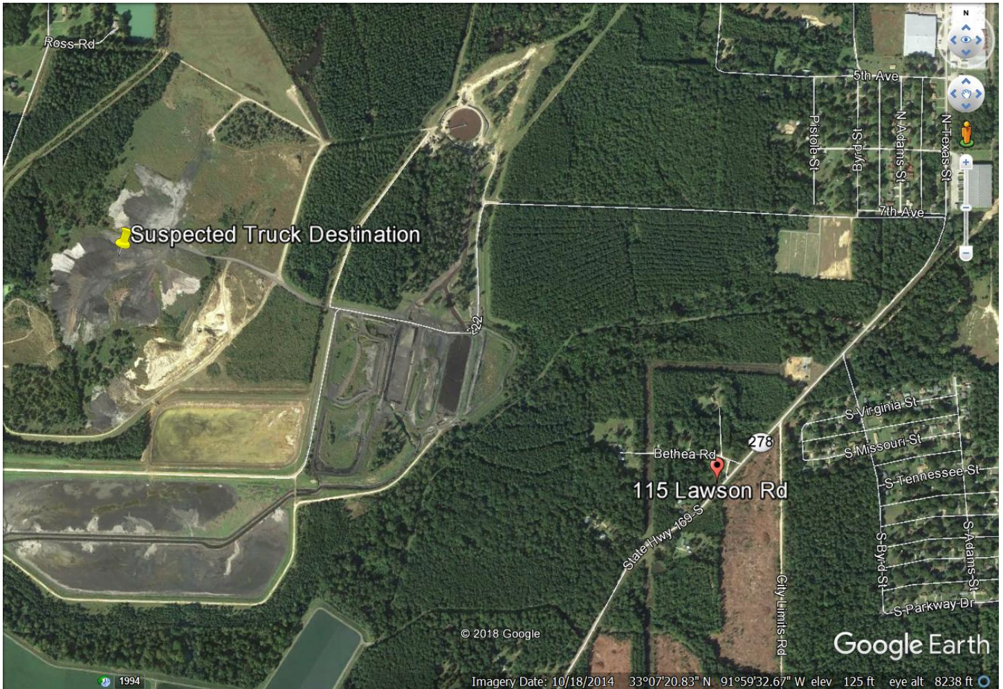
Figure 1. Overview of location of complainant address and suspected truck destination (ash landfill). 7 th Avenue is the entrance and exit for the WWTP and the location where Hydrogen Peroxide trucks enter and exit two (2) days per week.