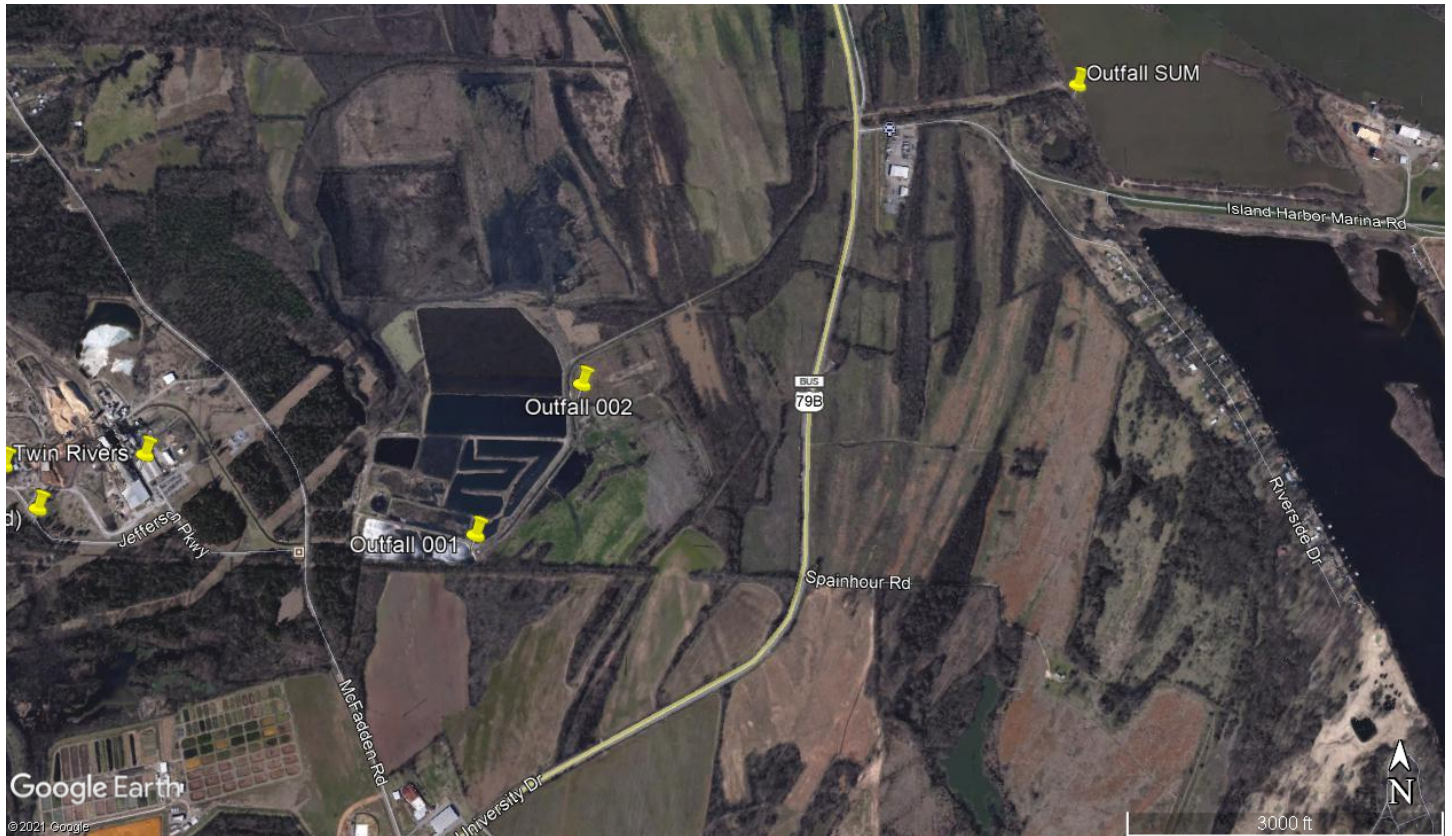
Figure 1. Google Earth image dated Oct 31, 2020 of permitted outfalls for Twin Rivers Paper Co.