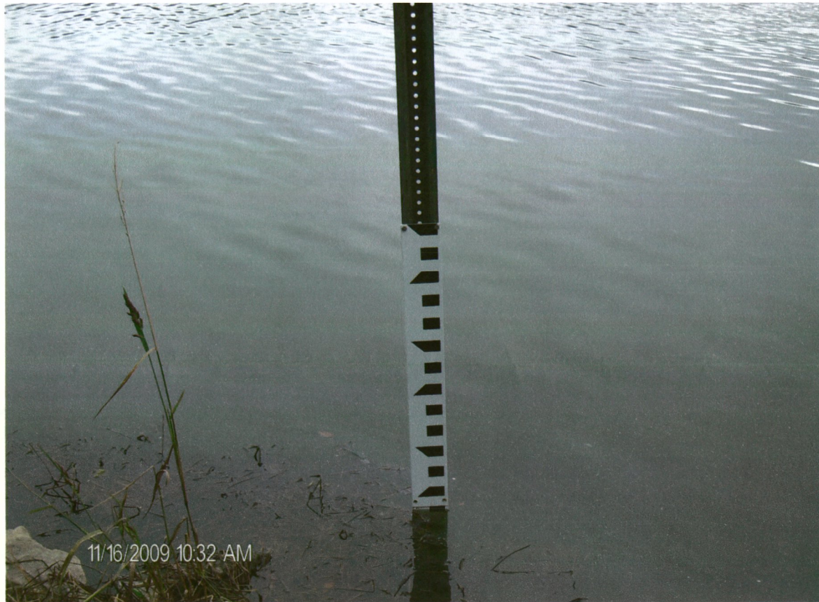
Image of Staff Gauge in the Equalization Basin The large marks indicate 6" with the top of the gauge representing the height of the levee.