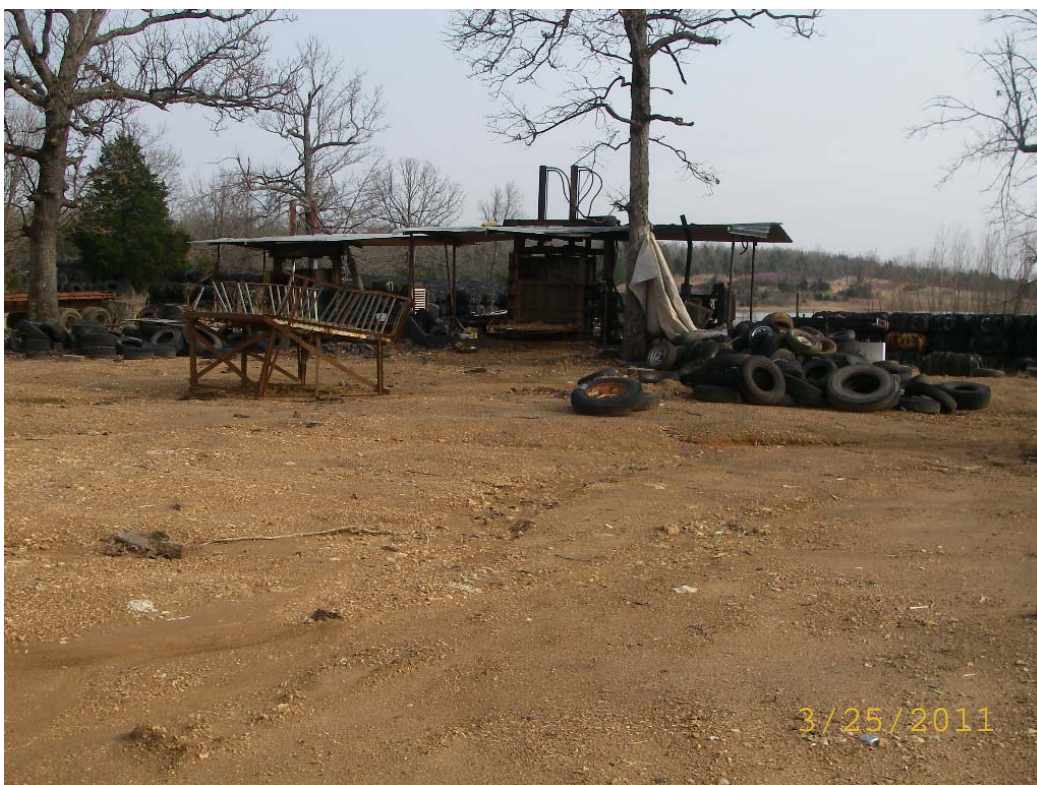
NWASWMD TP Site Inspection 0022-SWTP