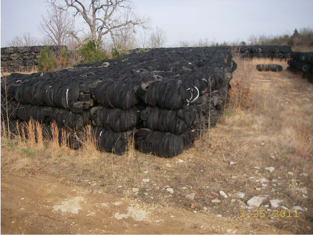
NWASWMD TP Site Inspection 0022-SWTP