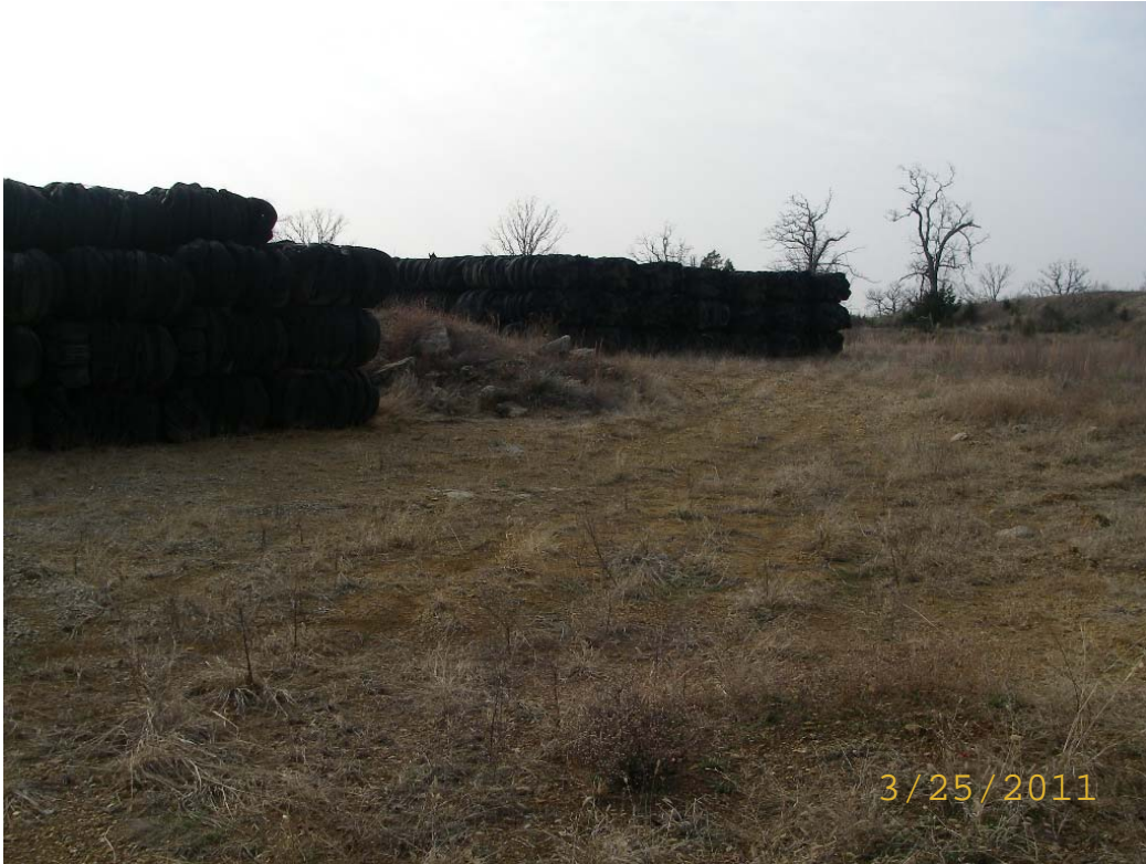
NWASWMD TP Site Inspection 0022-SWTP