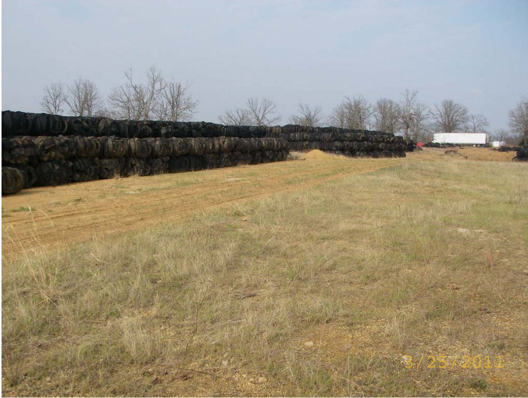
NWASWMD TP Site Inspection 0022-SWTP