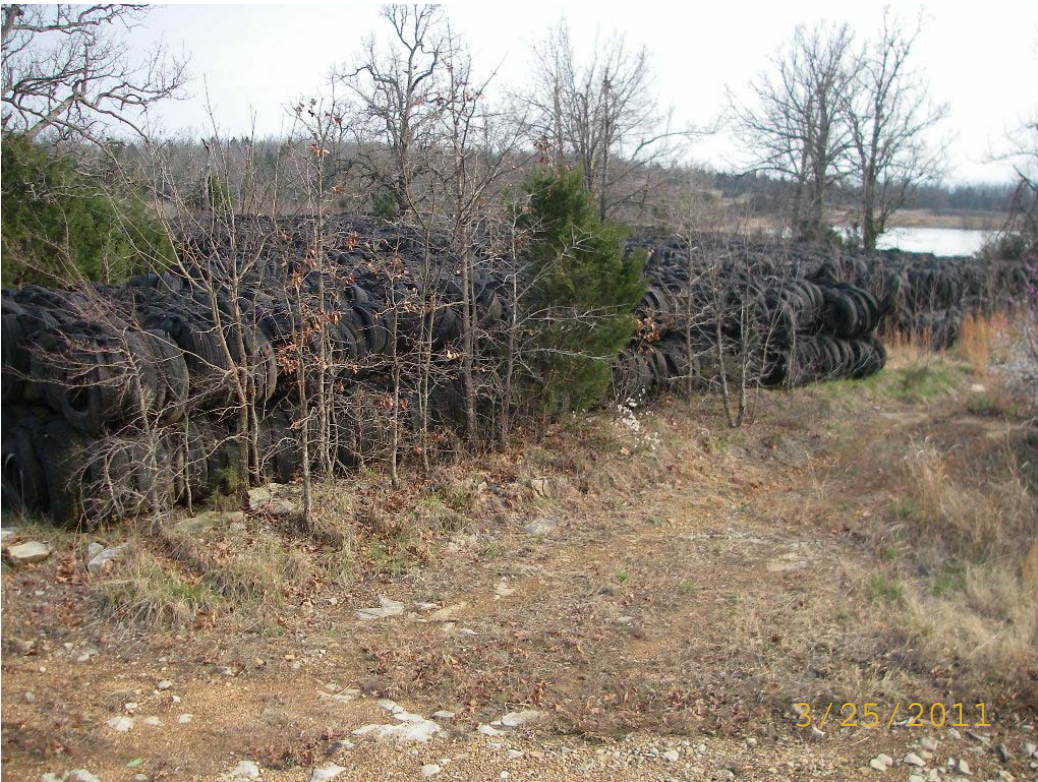
NWASWMD TP Site Inspection 0022-SWTP