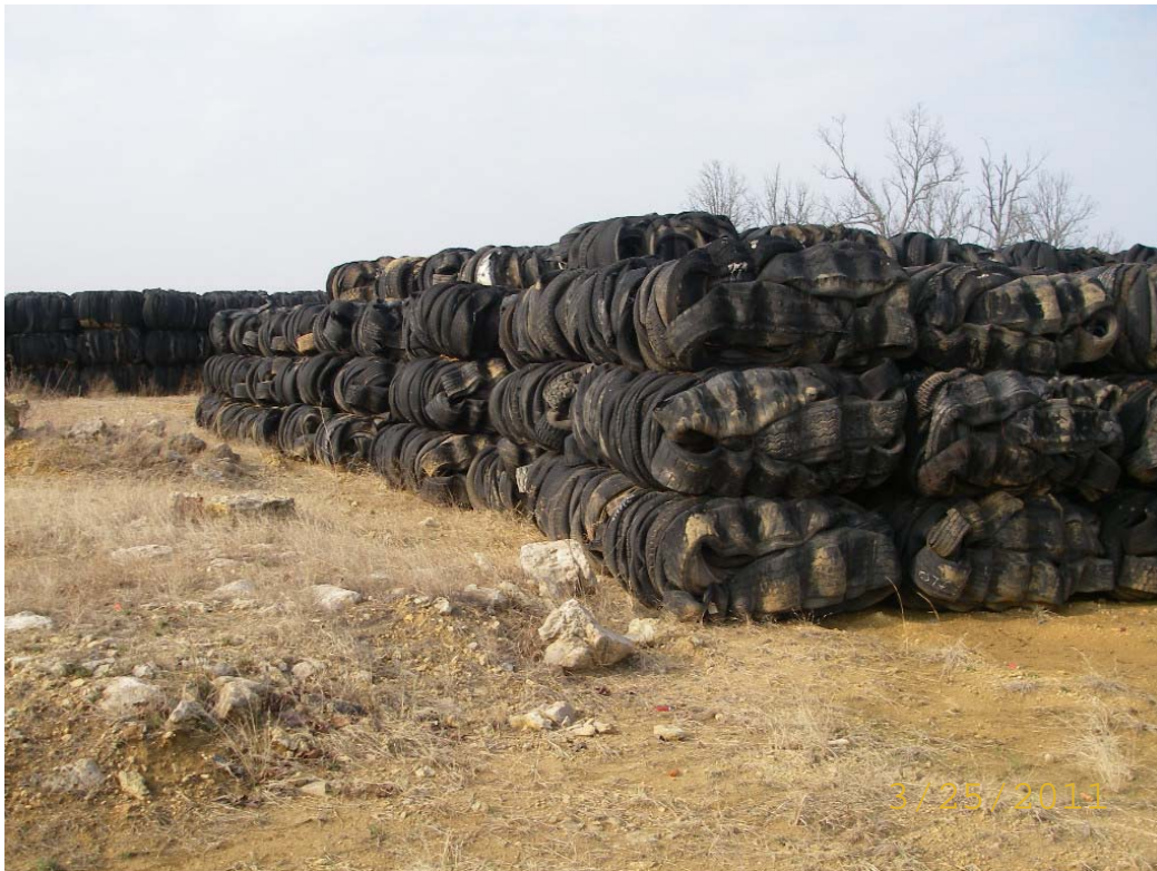
NWASWMD TP Site Inspection 0022-SWTP