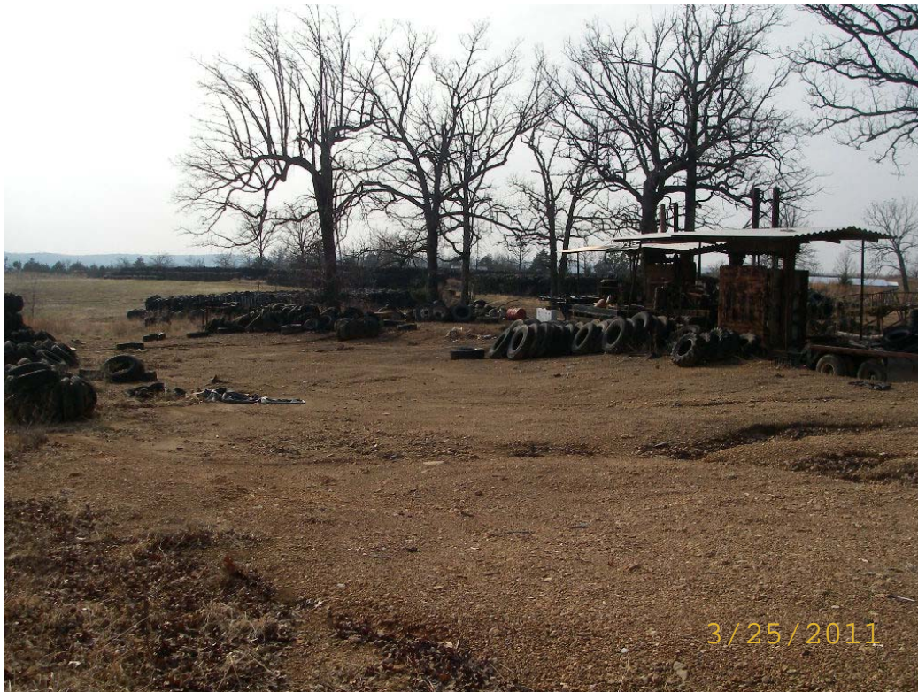
NWASWMD TP Site Inspection 0022-SWTP