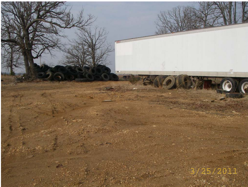
NWASWMD TP Site Inspection 0022-SWTP