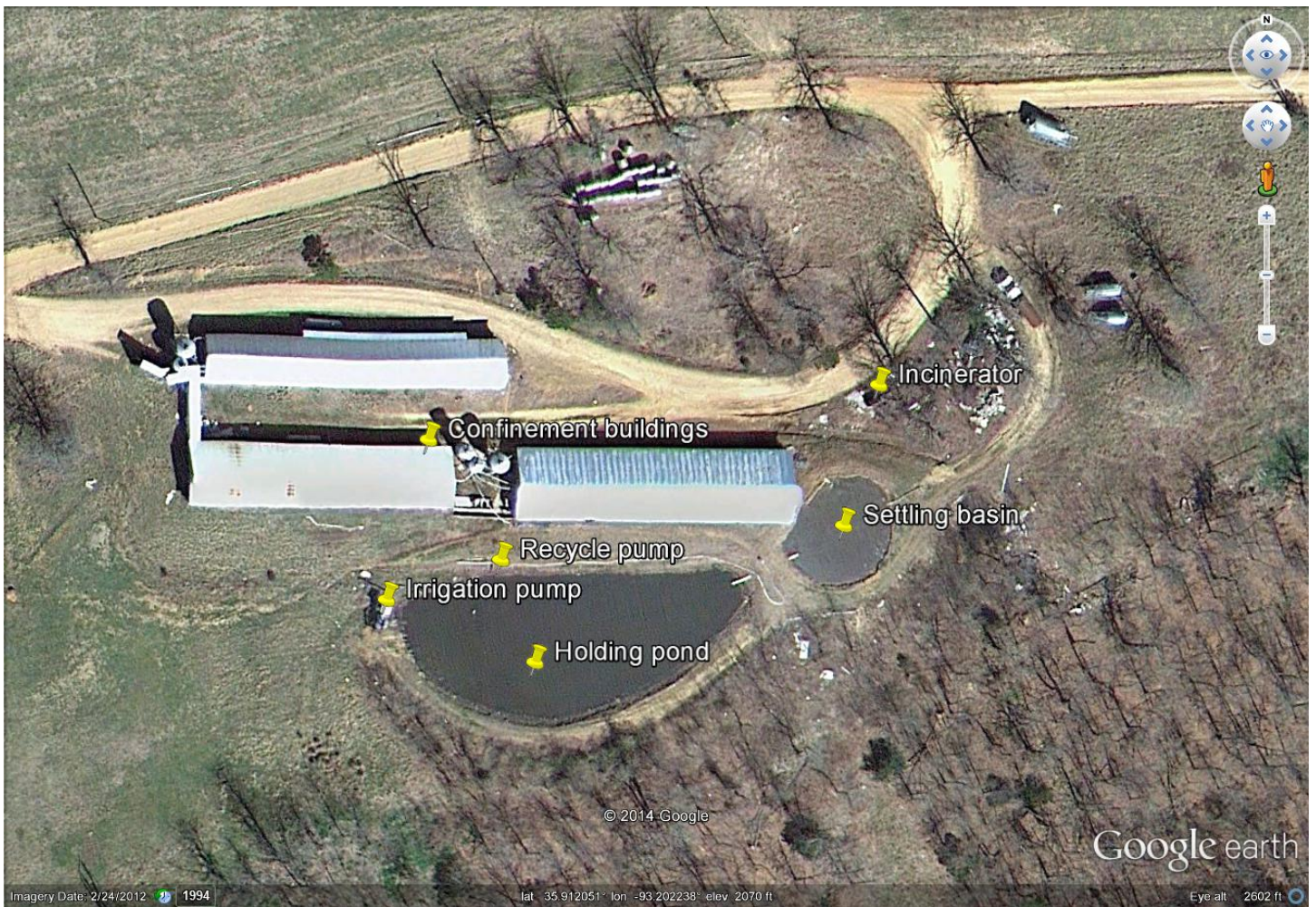
Figure 1. Google Earth image of the site as it appeared on 2-24-2012