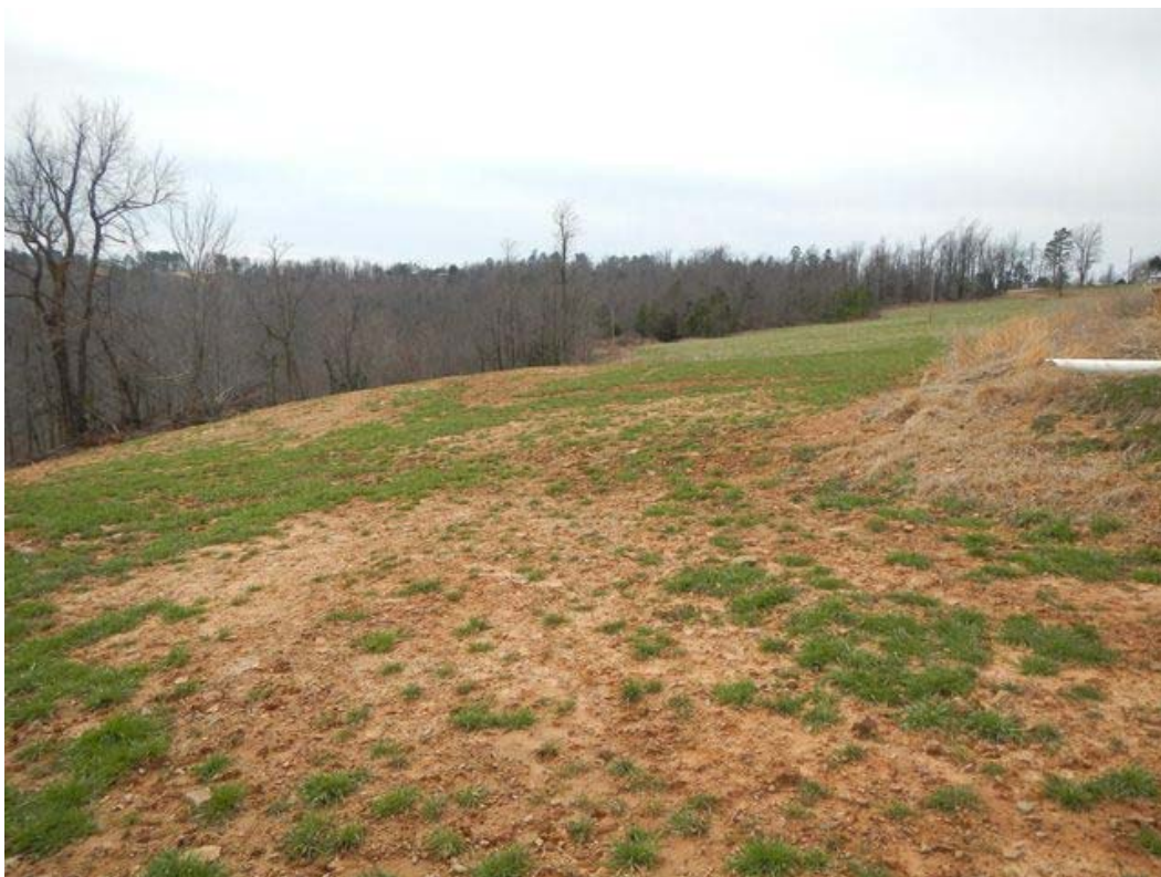
Prior location of now-closed settling basin and holding pond