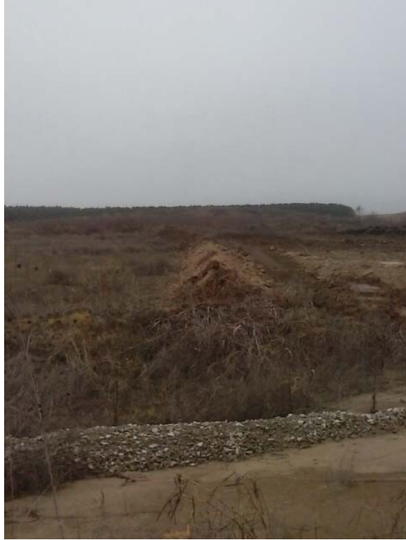
Permit 0200-S3N-R1 Facility Operator Photos 3 & 4