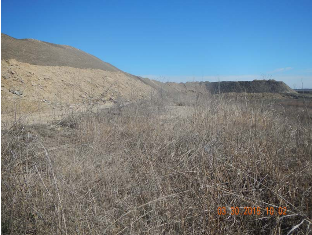
0200-S3N-R1 Photo 1