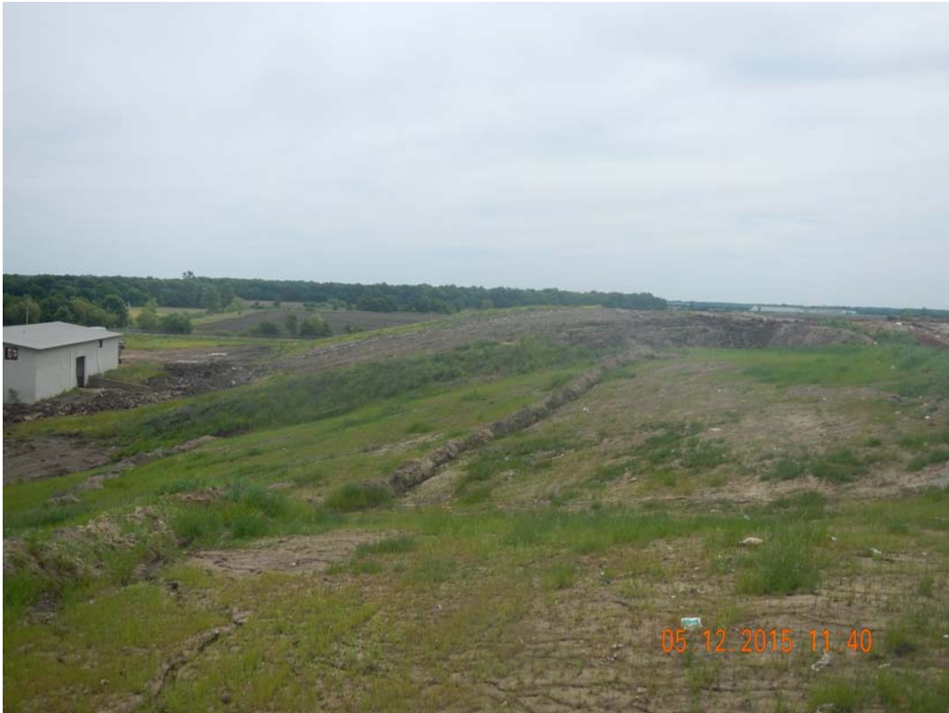
Voided Permit #0245-S4 Photo 1 & 2