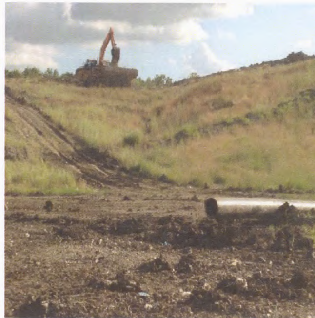
Completing Cut Noted during May 18, 2015 Inspection