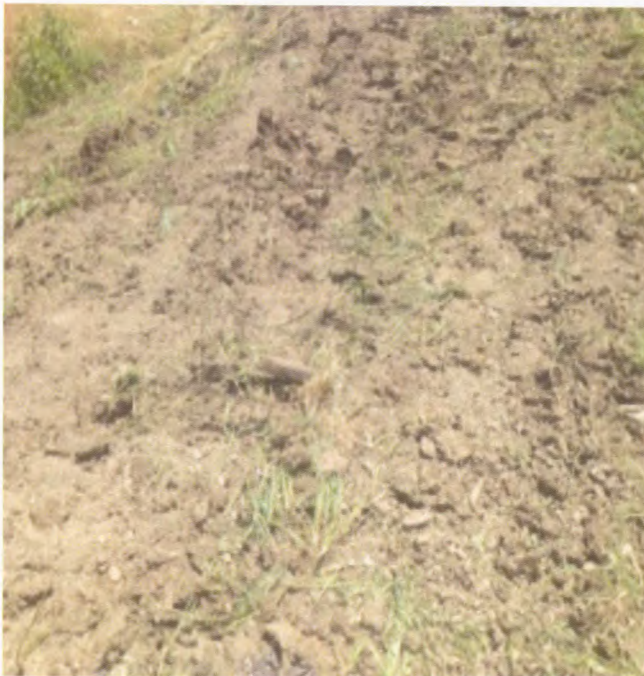
West Slope Area at North End Area Repaired