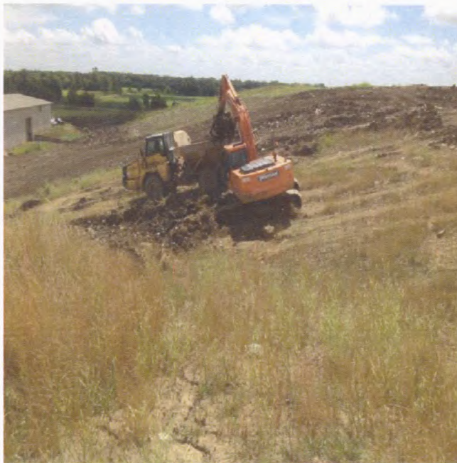
Overfill Removal On Nort Side of South Slope @ Corner

Corrective Action: Overfill continues to be removed and remaining overfill, as of June 11th at 11:00 am