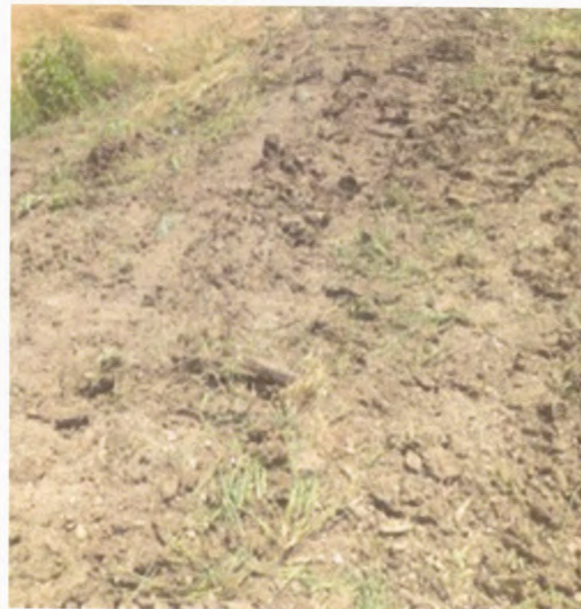
West Slope Area at North End Area Left Unprotected Ensuring Repaired