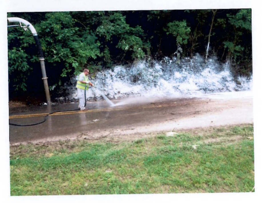
#5. Asphalt clean up, lime affected area