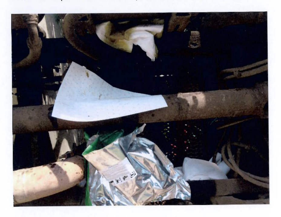
#3.b. Oil containment kit, disposal by Oros and Busch