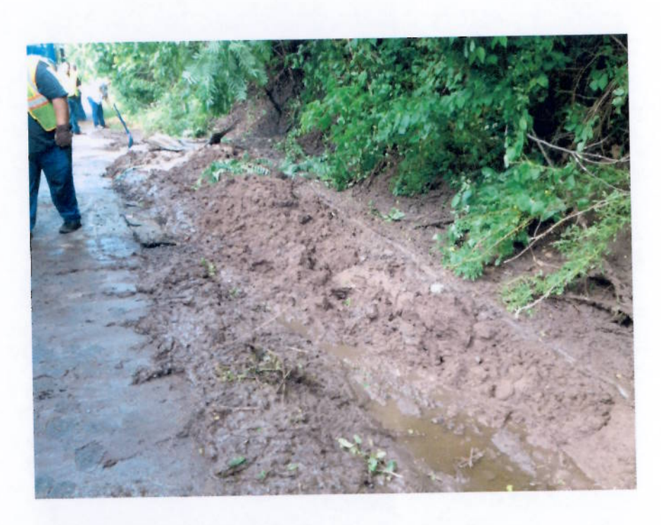
#4. Biosolids spilled from truck