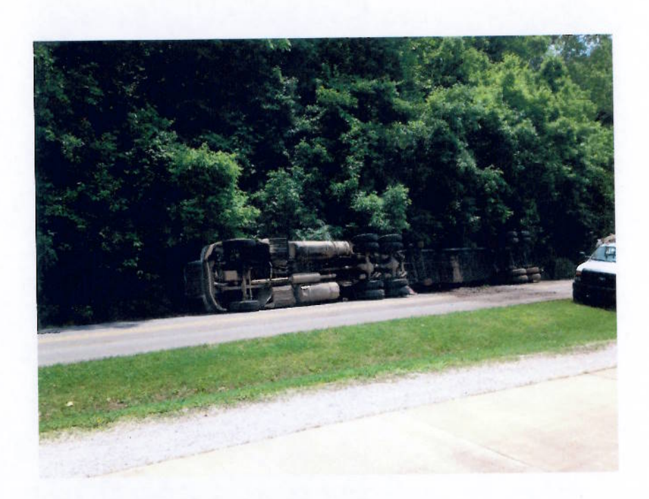
#1. June 3, 2015 Oros & Busch truck accident