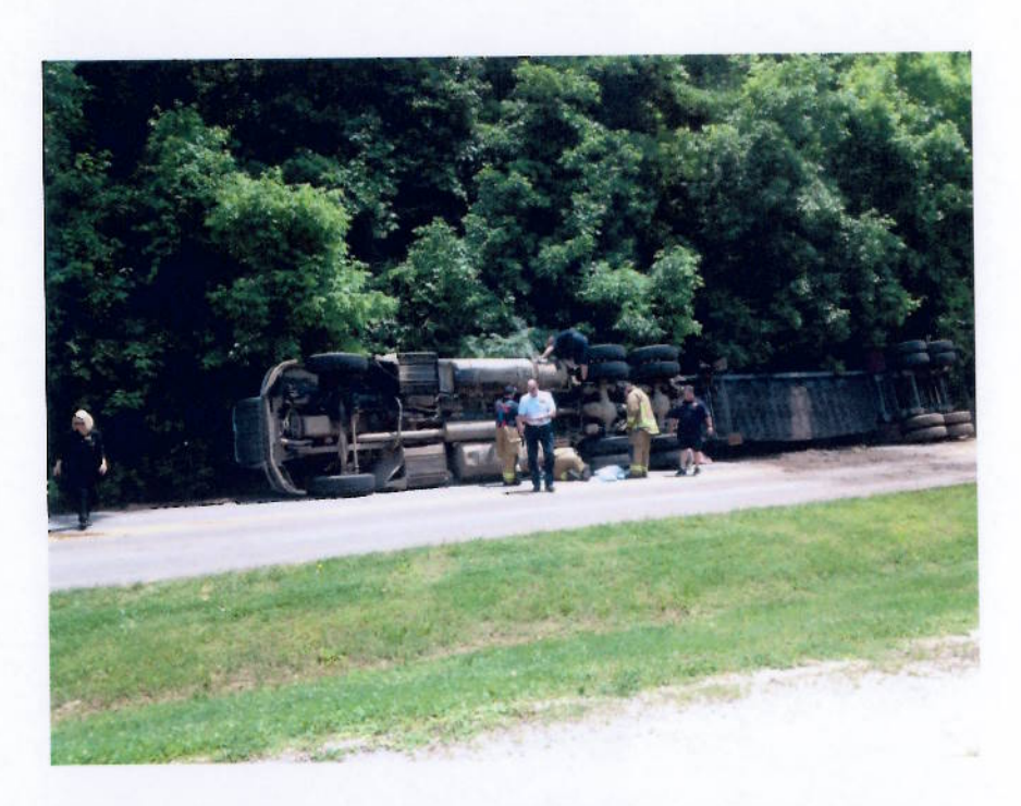
#3.a. Fire Department Crew responds to hydraulic oil leak