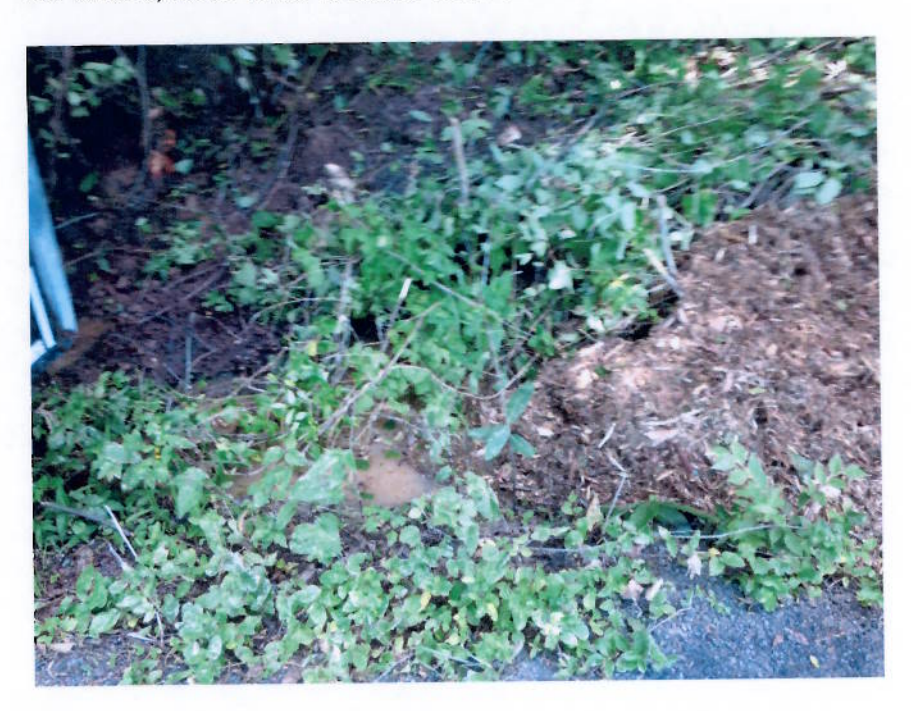
#2. Containment created on both ends of spill with wood chip berms.