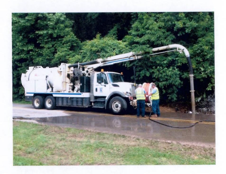
#6. Vactor wash water for proper disposal