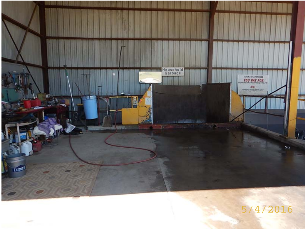
Permit Number 0071-STSW-A Photos 1 & 2