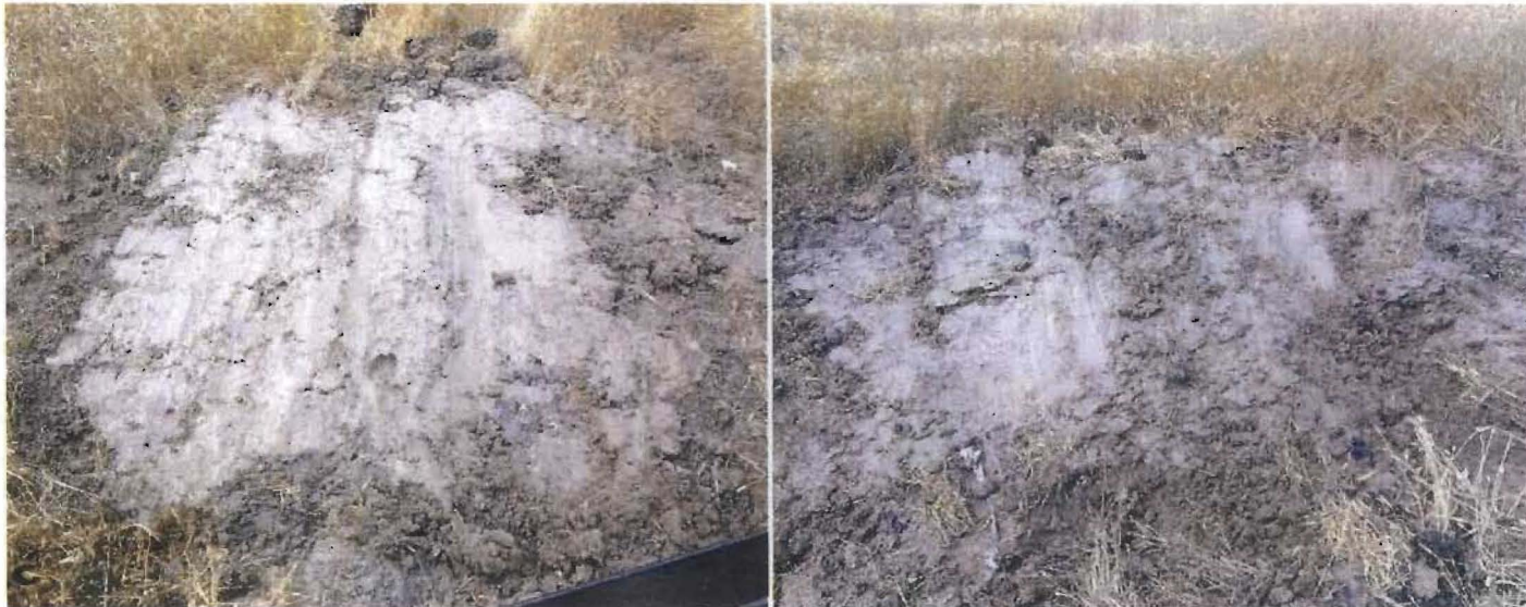
Leachate leaks were corrected on 5/26/2016