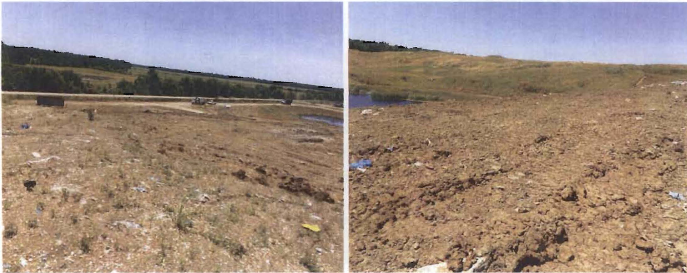
Insufficient cover was corrected on 5/26/2016

Corrective Action – Areas of insufficient cover were corrected on 5/26/2016