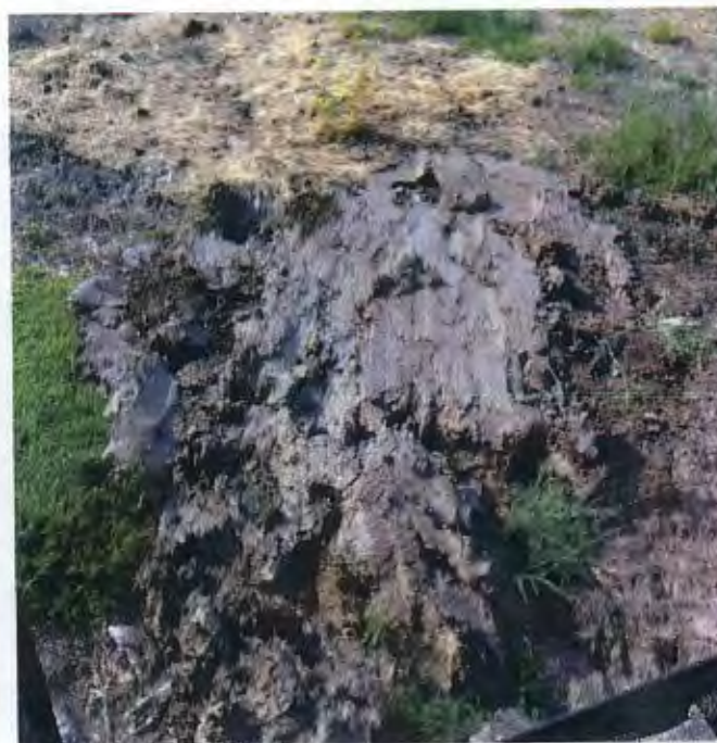
Leachate leaks were corrected on 8/2/2016