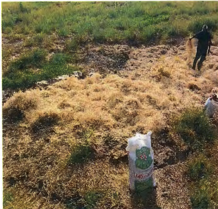
Leachate leaks were corrected on 8/2/2016