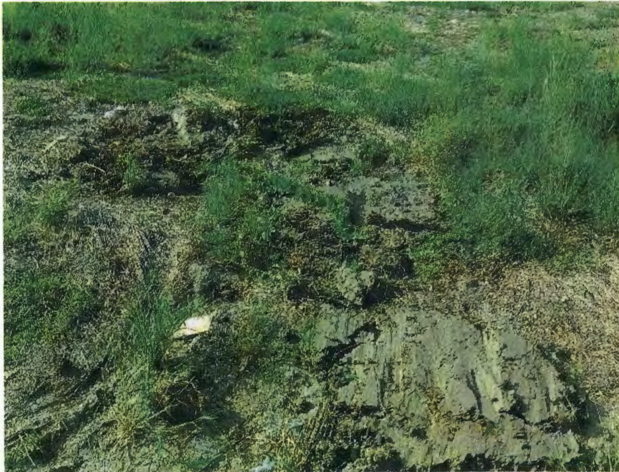
Leachate leaks were corrected on 8/2/2016