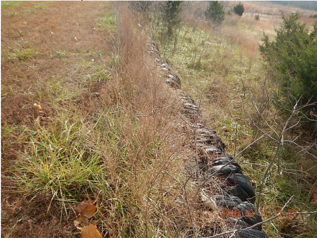
permit 0022-SWTP Photos 11 and 12