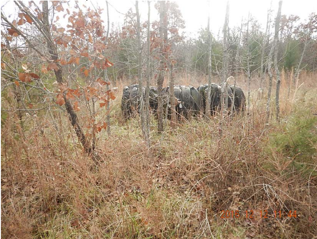
permit 0022-SWTP Photos 1 and 2