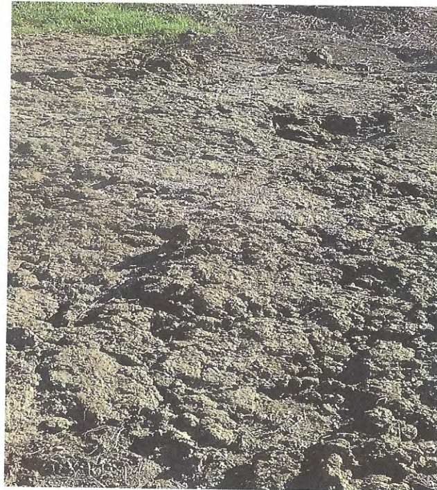
Leachate leaks corrected on 2/8/2017