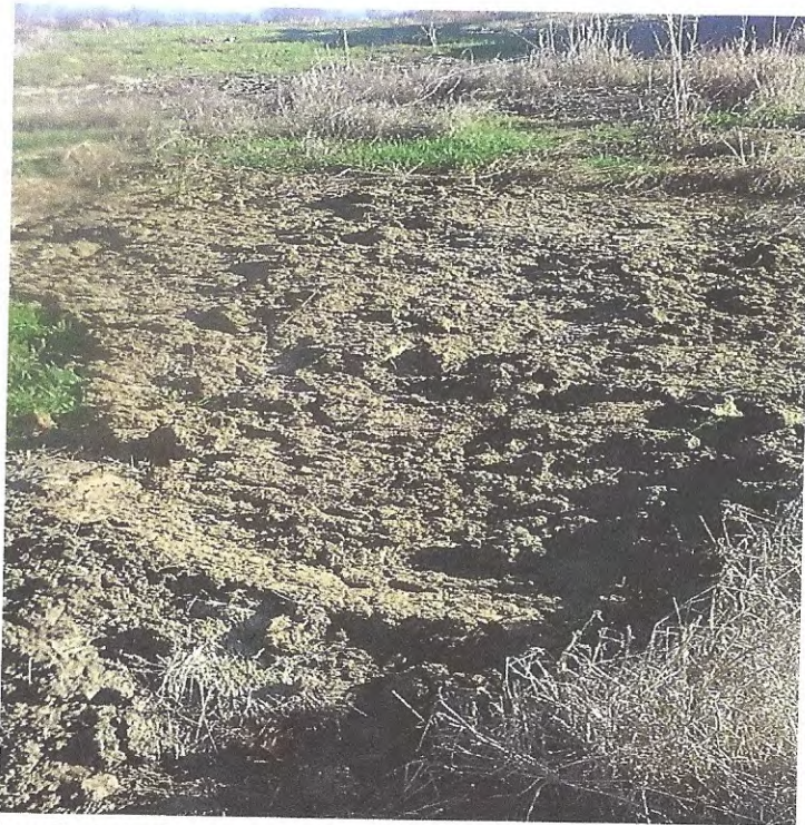
Leachate leaks corrected on 2/6/2017

Corrective Action – Leachate leaks were repaired