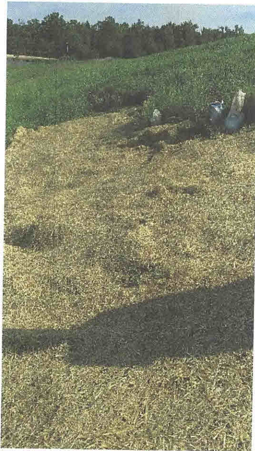
Leachate leak corrected on 5/1/2017