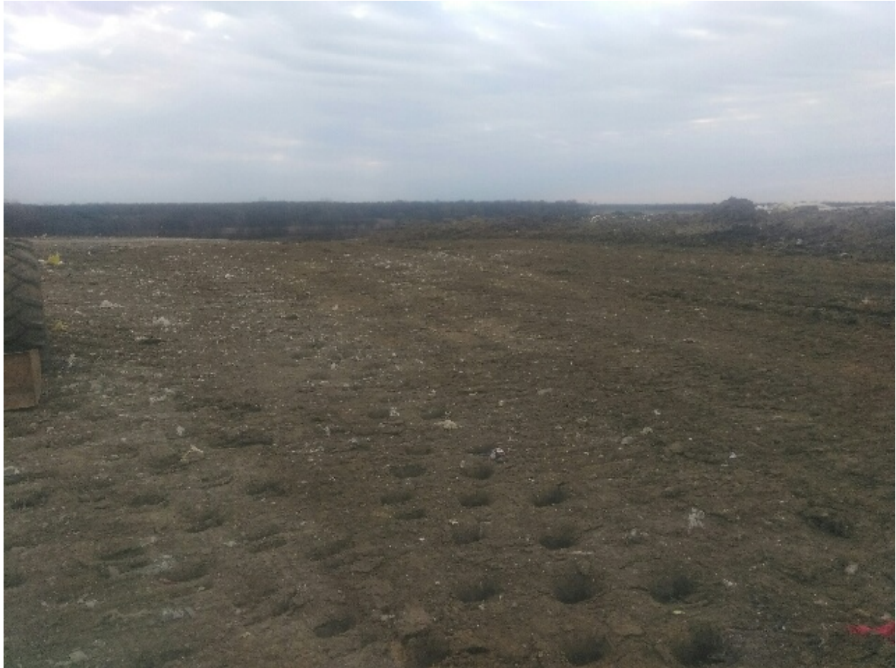
Top of Cell 3 looking East

Within 24hrs of Noted Allegations 411(h) (i) The Complete Area was surveyed. The Correction was made by cutting and filling in such away to allow for positive drainage. In addition Management has Trained Staff and Operators on the importance of Run on and Run off Procedures. (See Pictures Below of Correction Made.)