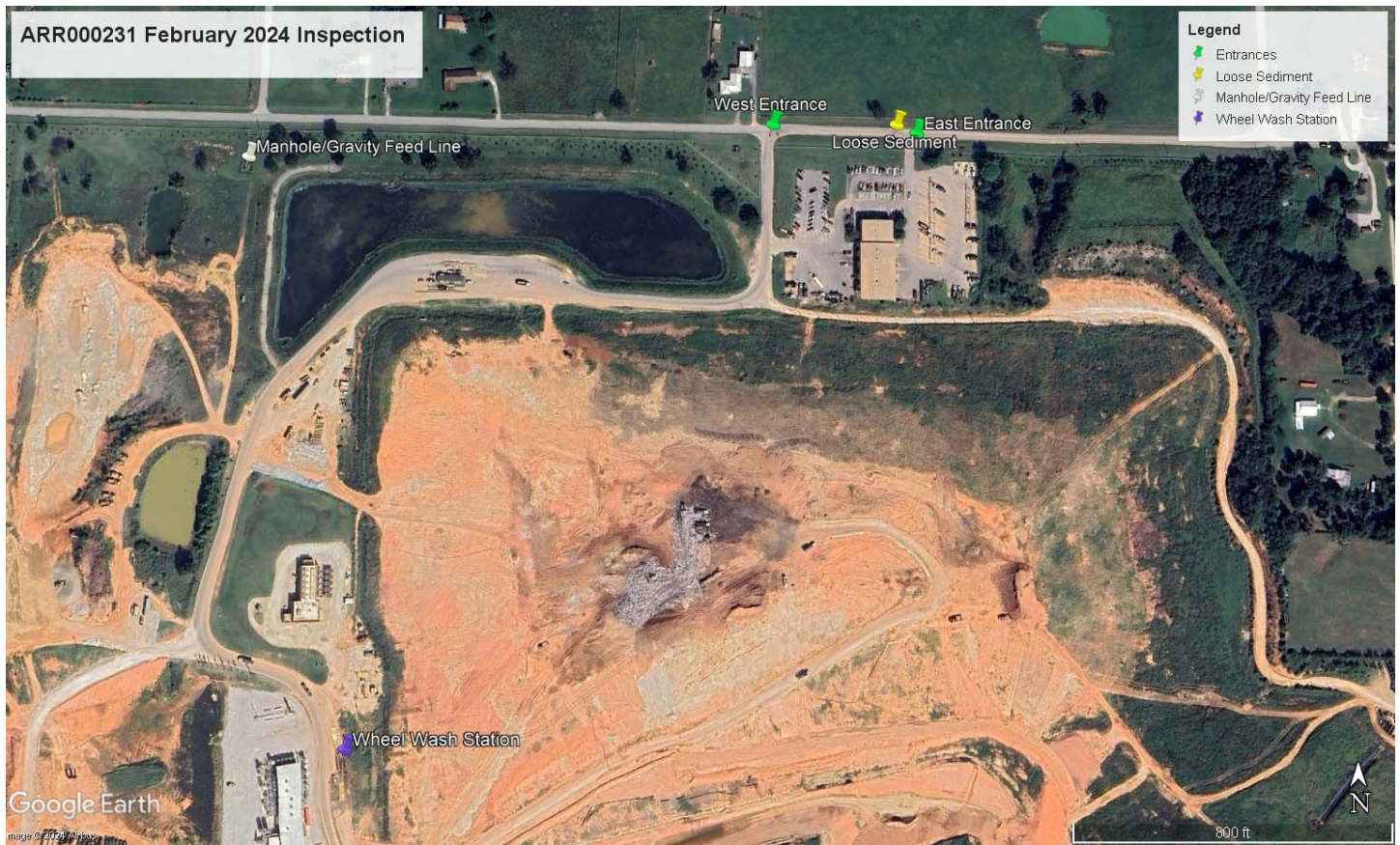
Attachment 1. Google Earth satellite imagery with locations of the wheel wash station, entrances, approximate location of loose sediment accumulation, and the manhole/gravity feed line where odors were expressed to have been located.