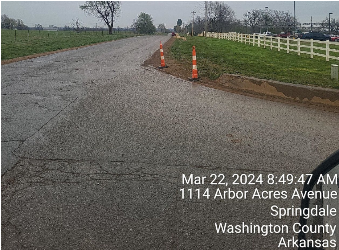
Barriers placed on shoulder at landfill entrance after cleaning