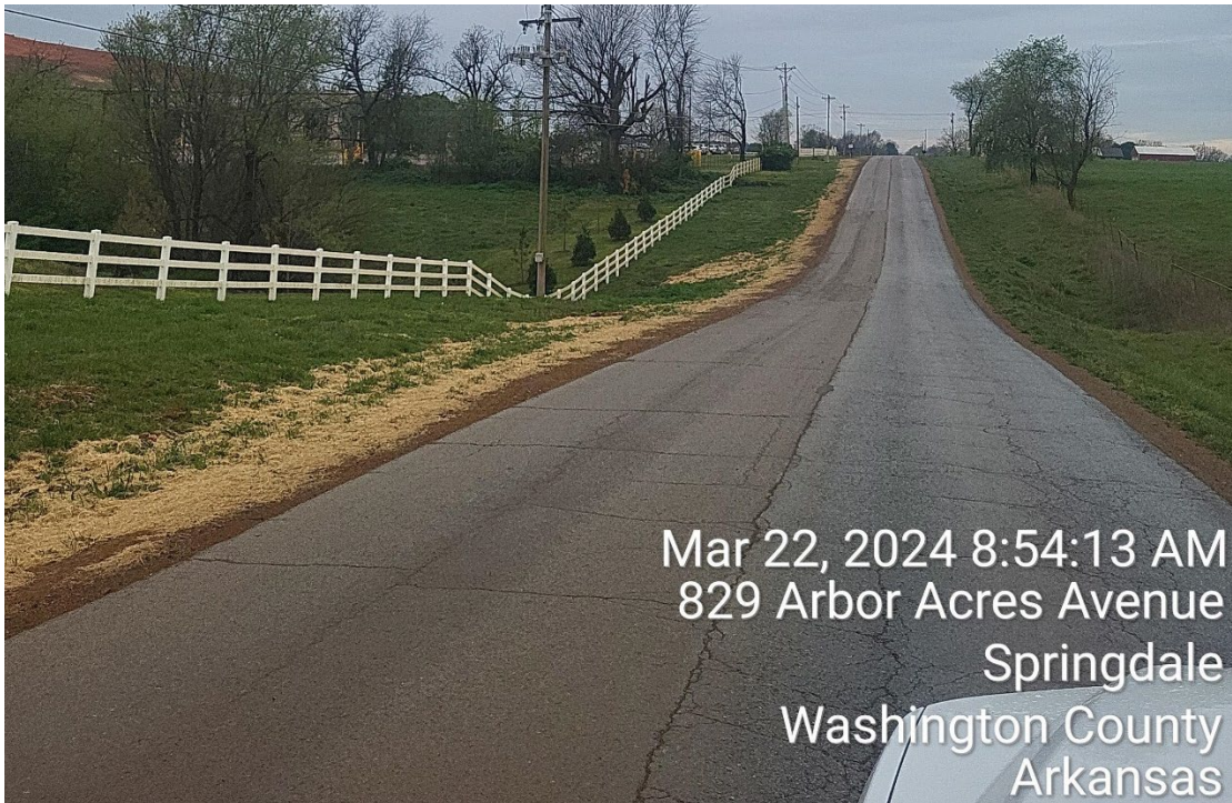
Arbor Acres looking west after sediment cleaning and straw application to cover exposed soils