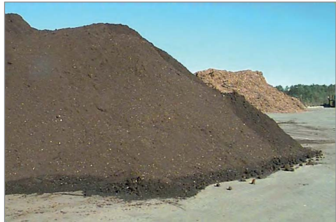
Finished compost (foreground) and mulch (background).

As the active composting process progresses, windrows are gradually combined until finally, a large curing pile is constructed for final compost curing. The curing process allows time for the compost process to progress to maturity.