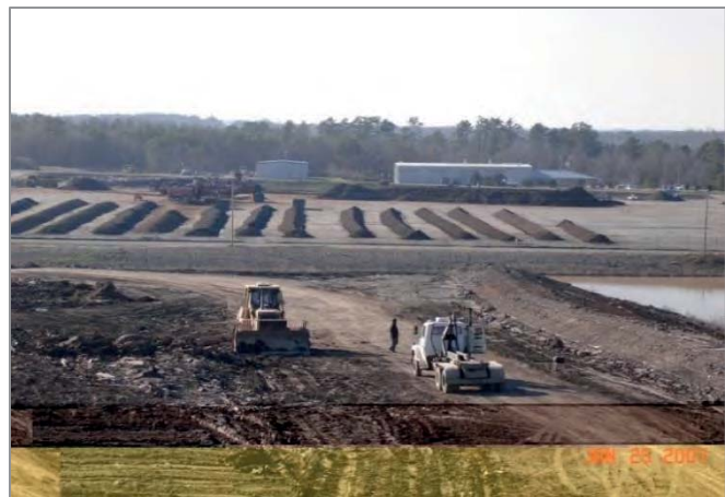
The yard compost site utilizes the windrow method of composting. This facility also produces mulch and boiler fuel.

Incoming yard waste is unloaded at a designated receiving area. Unacceptable items or oversized items such as large tree trunks are sorted out and disposed at the landfill. The remaining yard waste is then processed by grinding for size reduction.