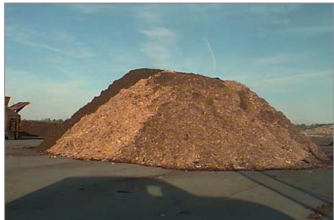
Boiler fuel is composed of ground hard and soft wood.

After the curing process is complete, the compost is screened to reduce particle size and screen out plastic bag remnants and oversized materials. Final screening produces a uniform, high-quality material suitable for use as a soil amendment. Screen rejects are disposed of in the Class 1 landfill.