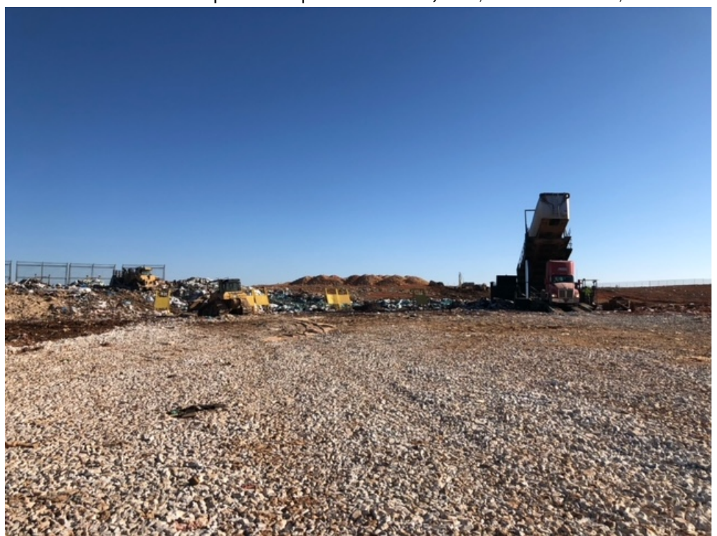
Class 1 workface turnaround