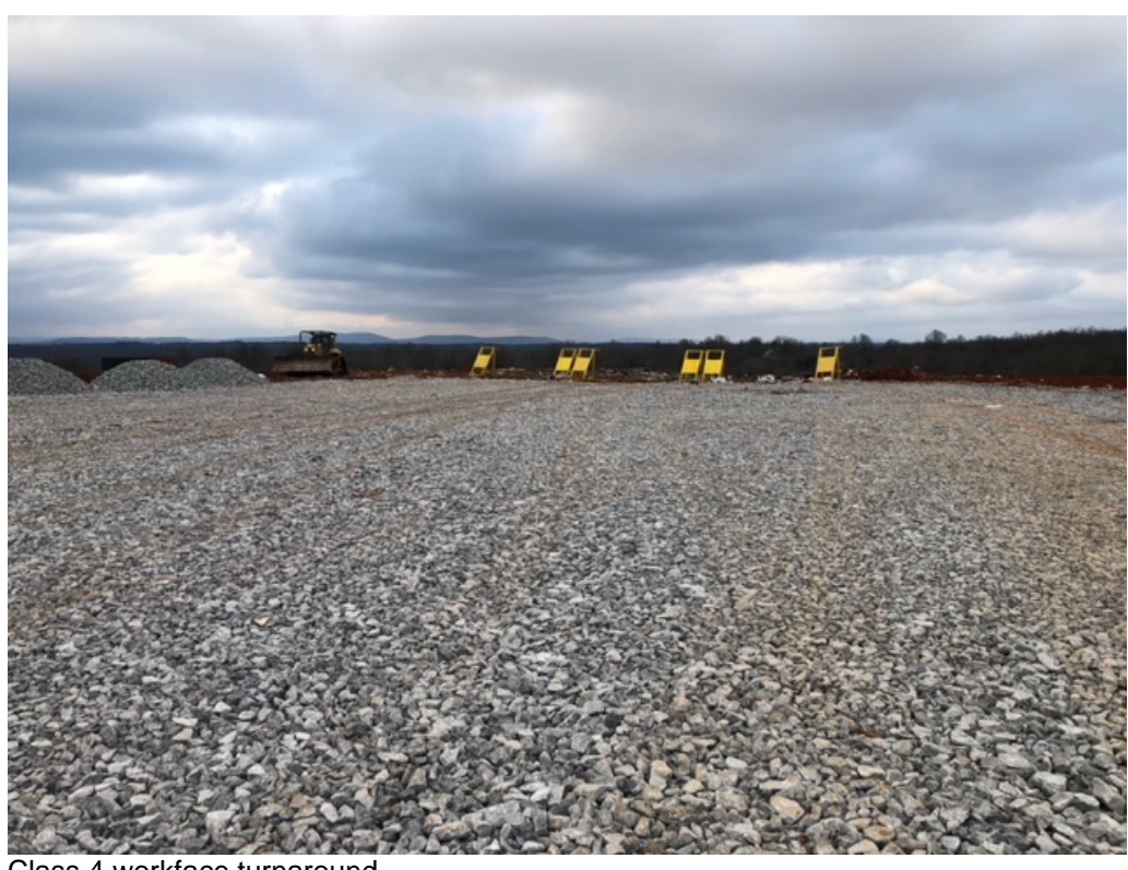
Class 4 workface turnaround

Good morning! Below please find Rock placement and grading of Class 1 and Class 4 areas, per our discussion last week. Apologies for not sending Friday, I was off work without computer access.