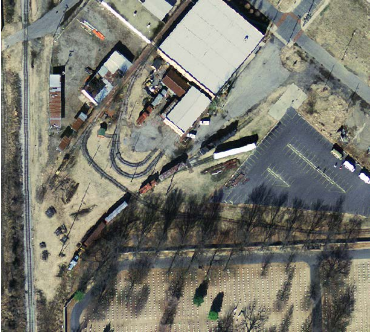
Aerial Photo: Former US Forgecraft Property - Forth Smith, Arkansas