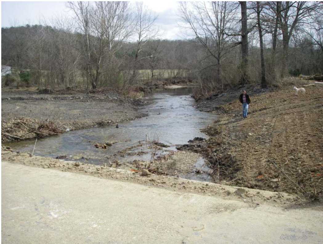
Two more photos of the downstream side of the current bridge, with the unstabilized areas right down to the water line. There were no erosion controls at this site.