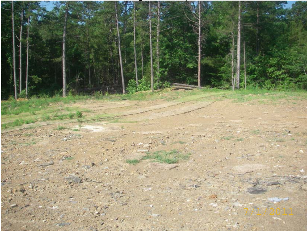
Deverso Wright follow-up 7-1-11