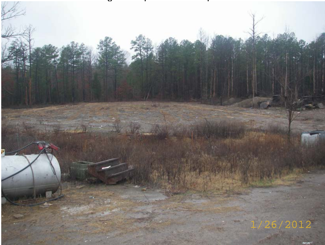
Deverso Wright Complaint Follow-up Photos 1 & 2.