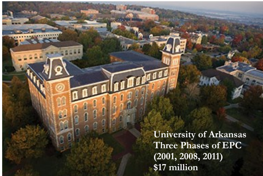
University of Arkansas Three Phases of EPC (2001, 2008, 2011) $17 million

The Arkansas Energy Office offers no-cost assistance to state agencies through the new Arkansas Energy Performance Contracting (AEPC) Program for state agencies, institutions of higher learning, municipalities, and counties. The program provides an effective and user-friendly process with standard documents and help every step of the way. The AEPC Program was directed by law in 2013 and approved in 2014, with the program developed by a number of industry professionals, state agencies, and financial representatives.